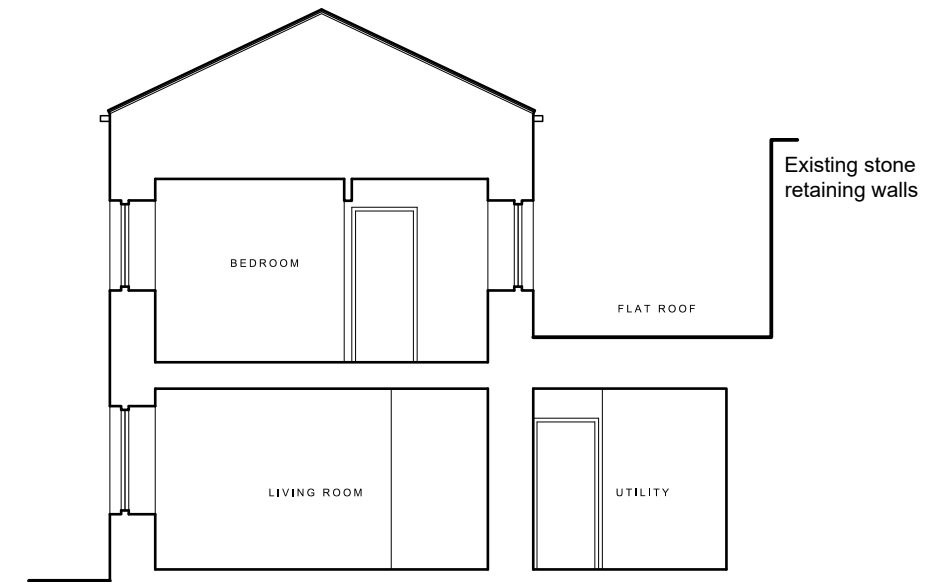
EXISTING SECTION A-A SCALE 1:100