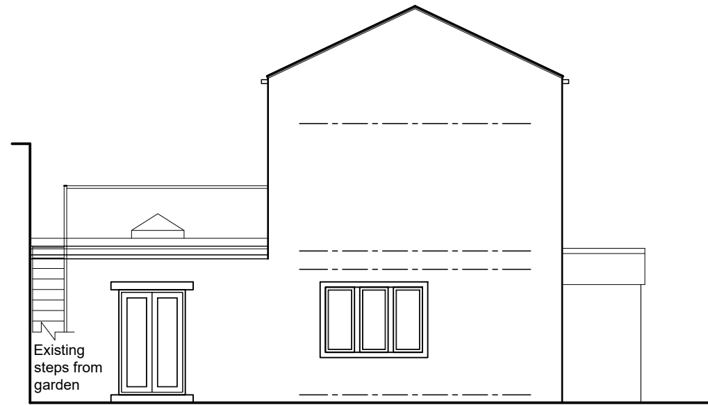
EXISTING GABLE (south west) ELEVATION SCALE 1:100