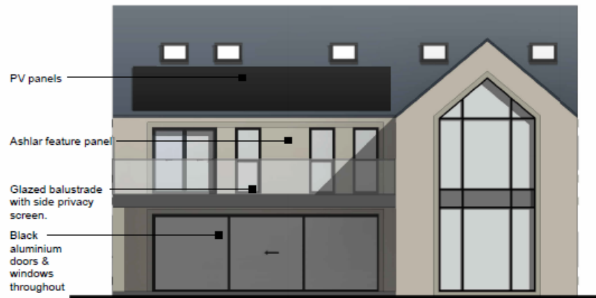
Proposed Rear Elevation (East)