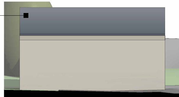
Proposed Side Elevation (West)