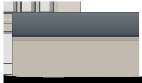
Proposed Side Elevation (East)

P0 Drawing originated. 05.02.26 Rev No. Description Drawn: Date