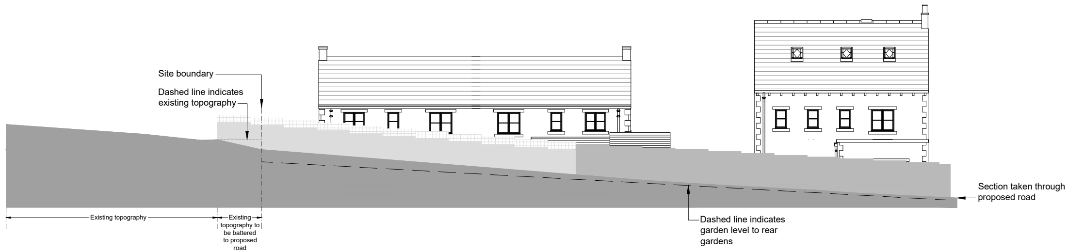
Section 5 - 5 No turning head constructed 1:200