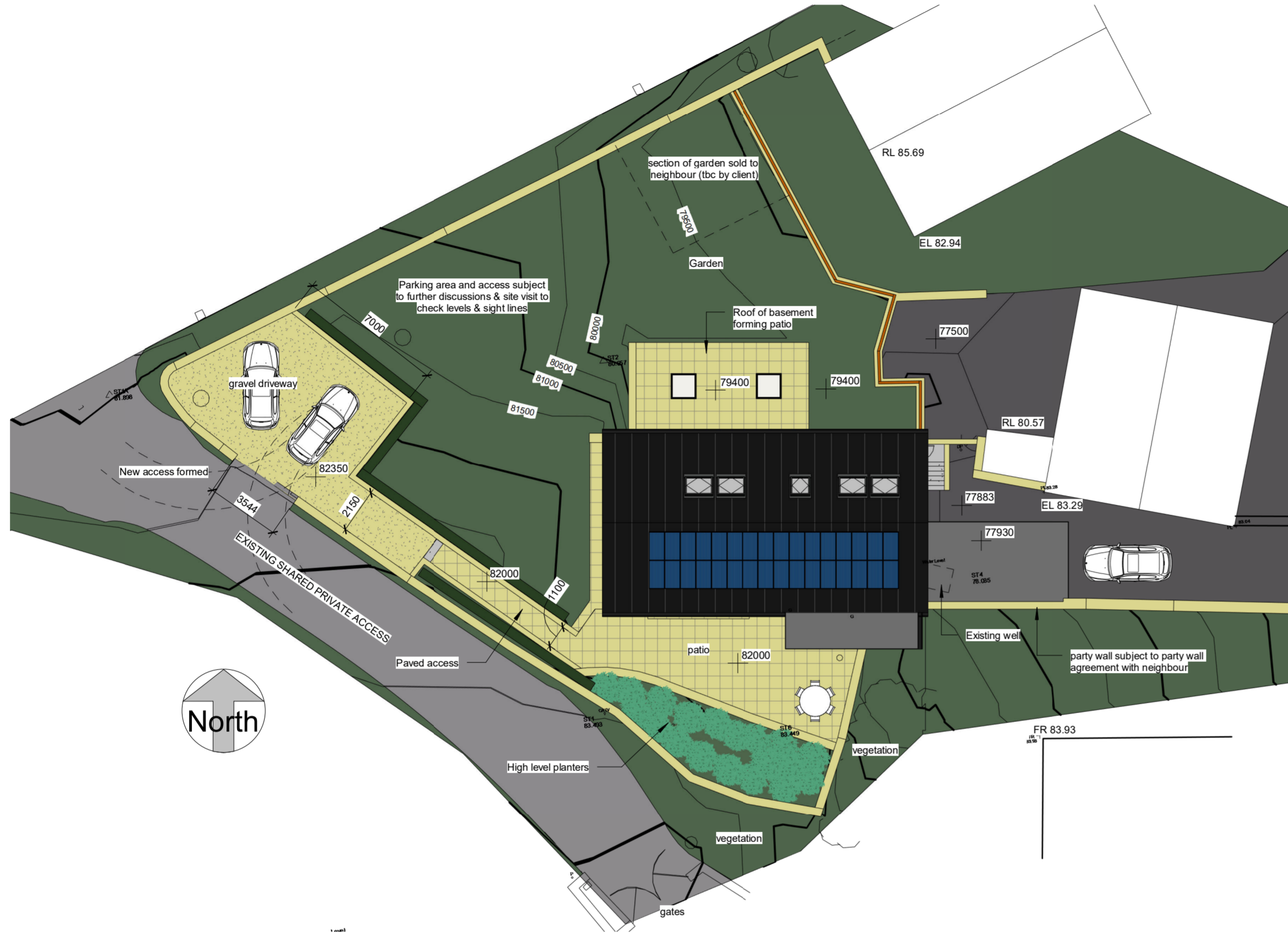
Site Plan 1 : 200