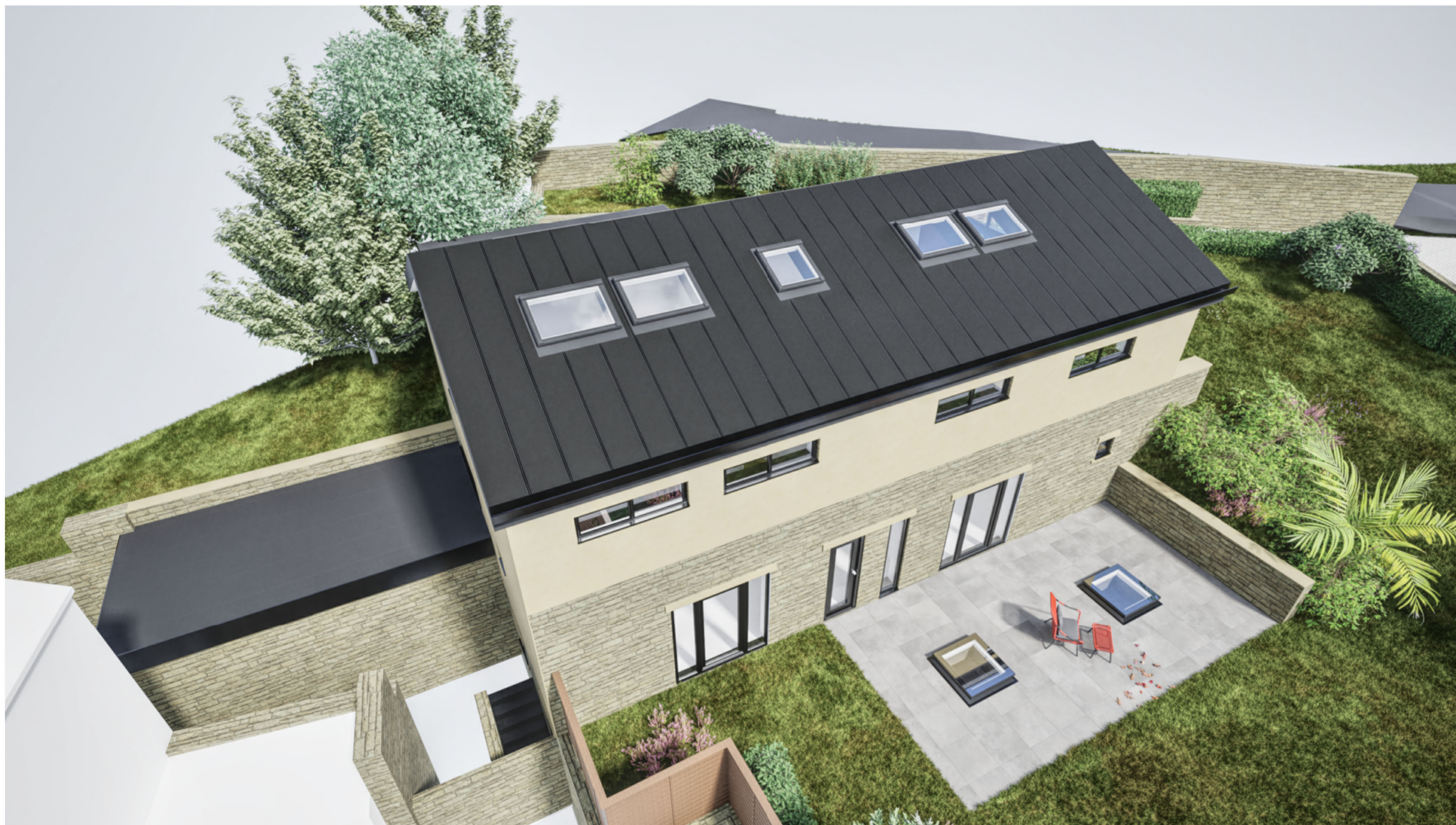
Artists Impression B - North Facing Elevation