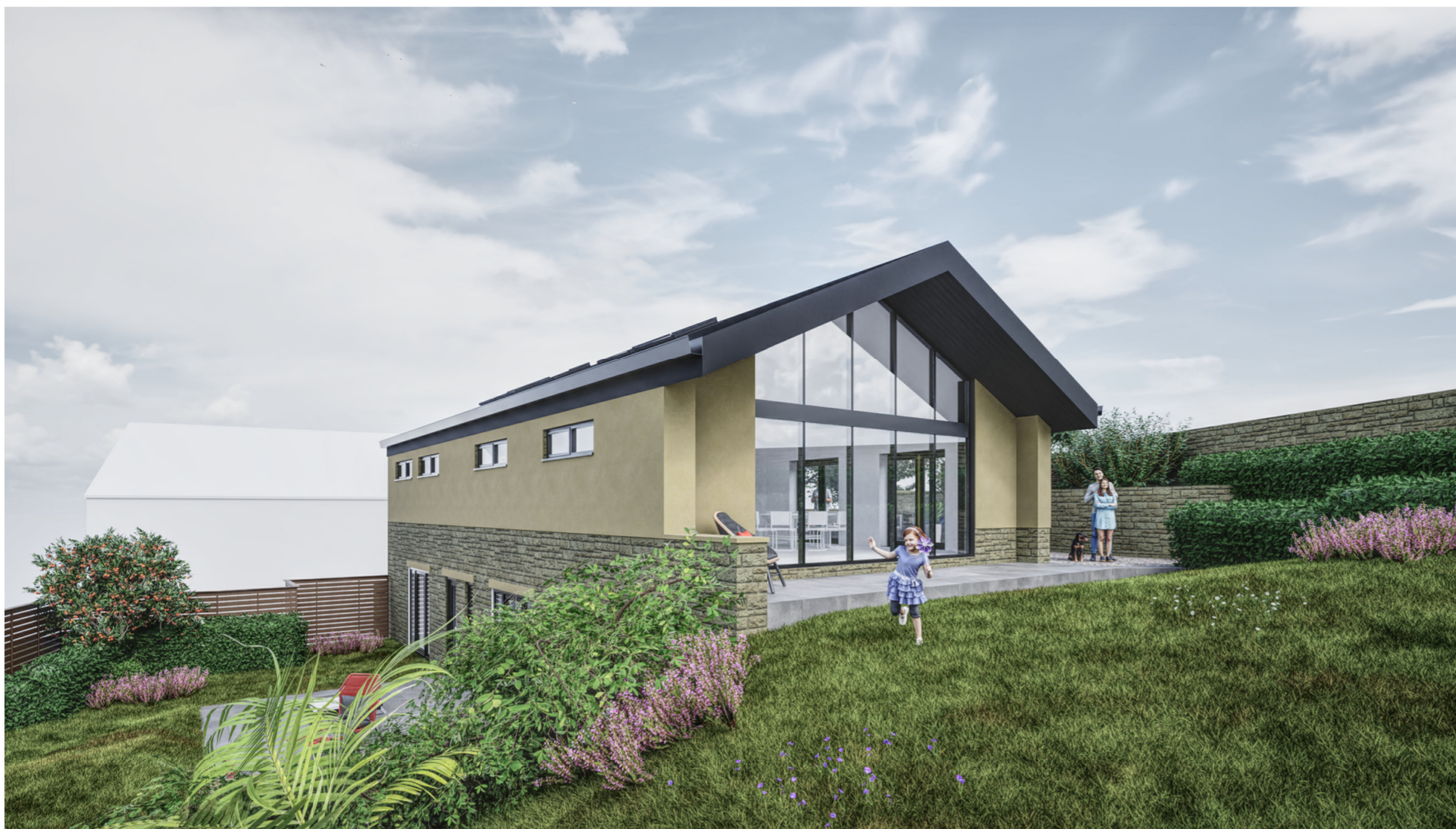
Artists Impression A - West Facing Elevation