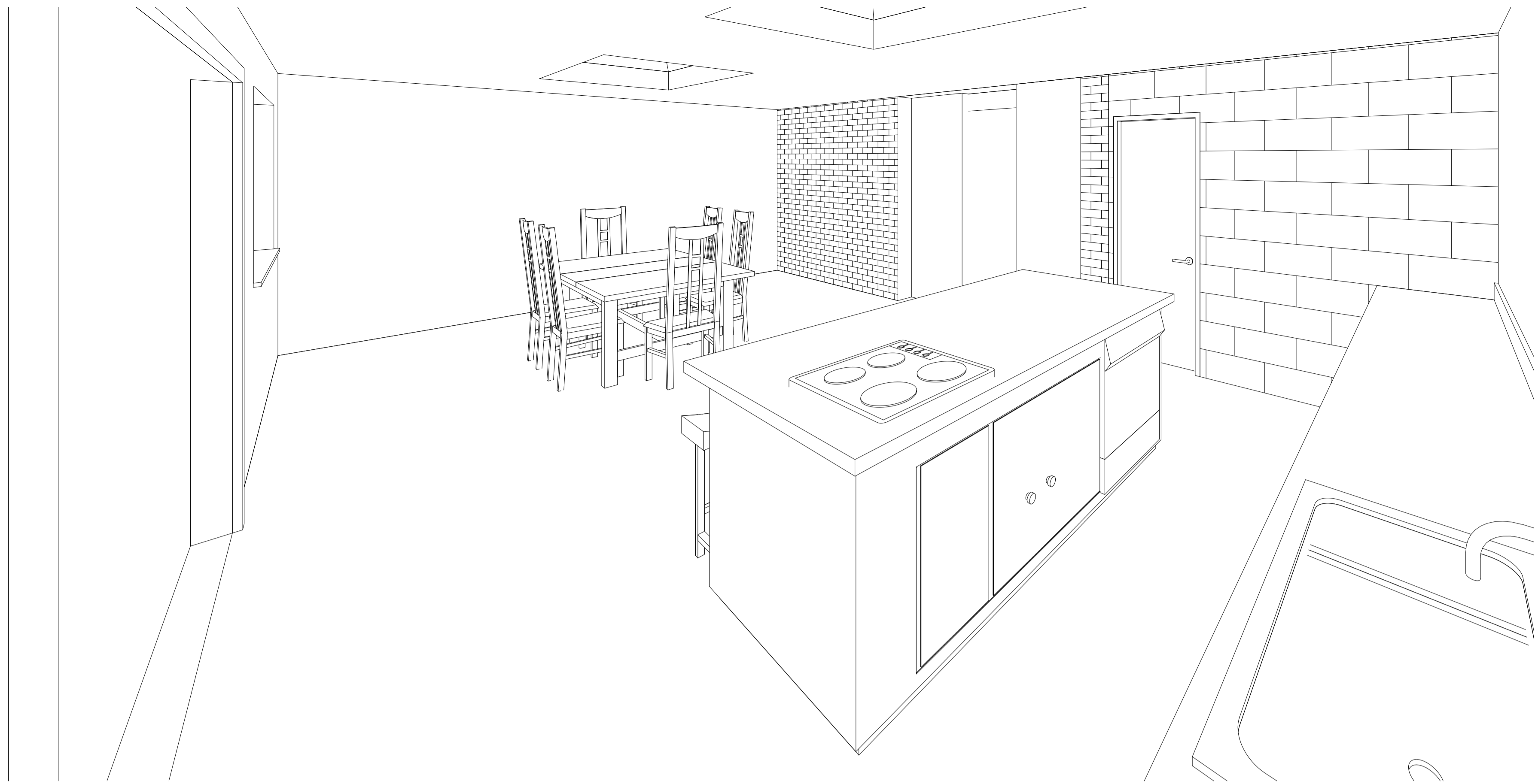
Proposed Kitchen 3D