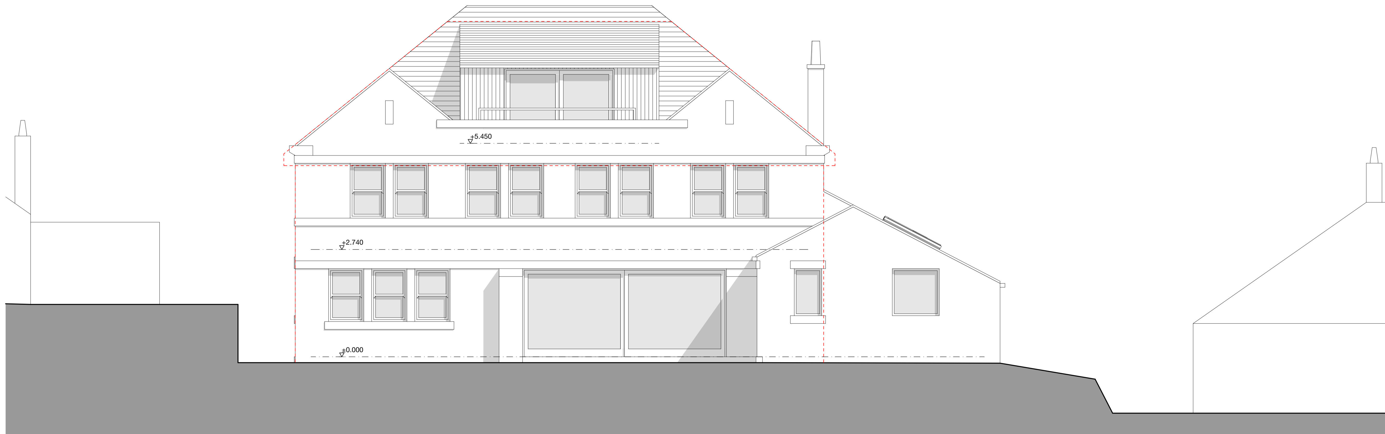
Proposed North Elevation - 1:50