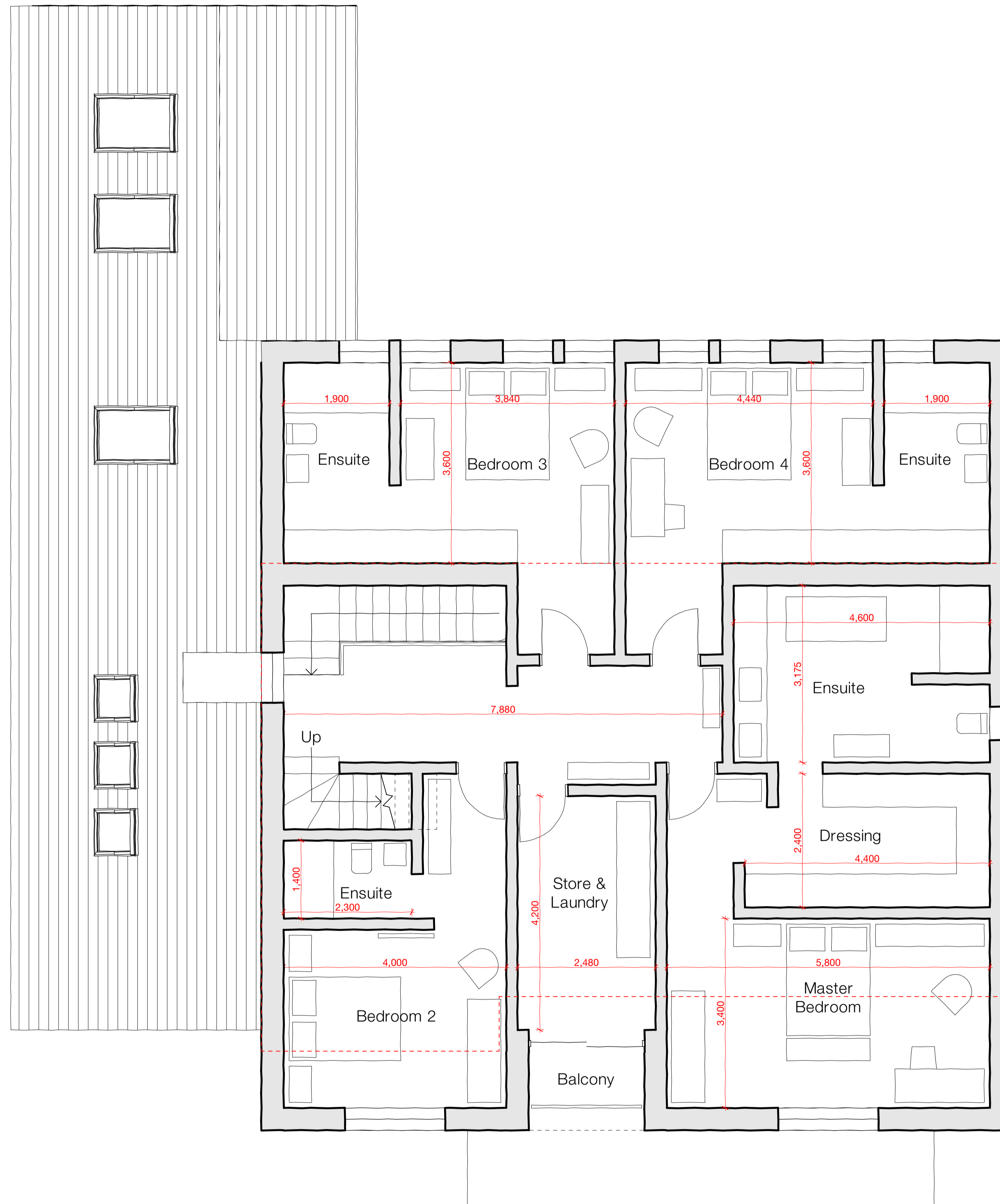
Proposed First Floor Plan - 1:50