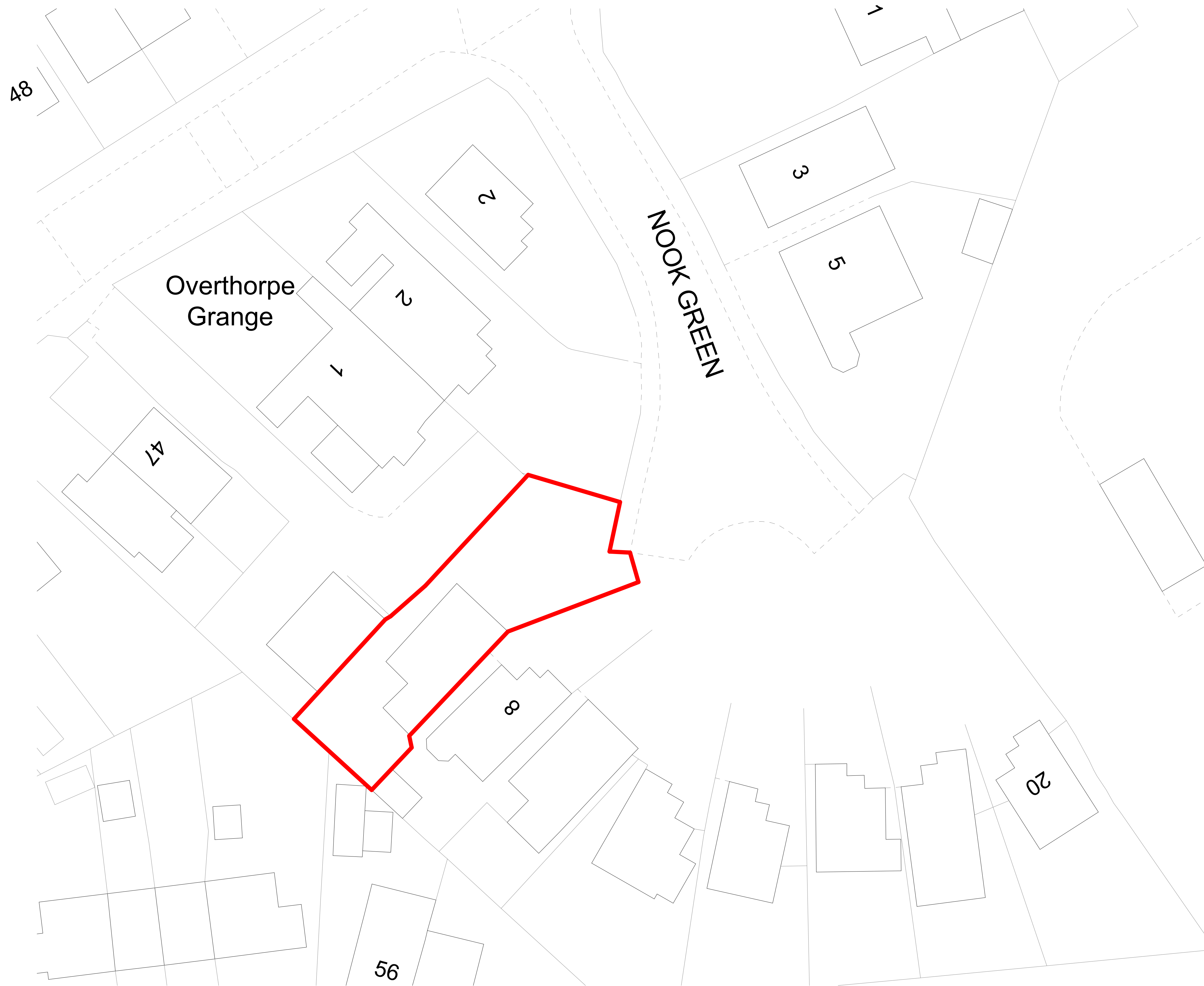
1 Site Plan - 6 Nook Green 1 : 200