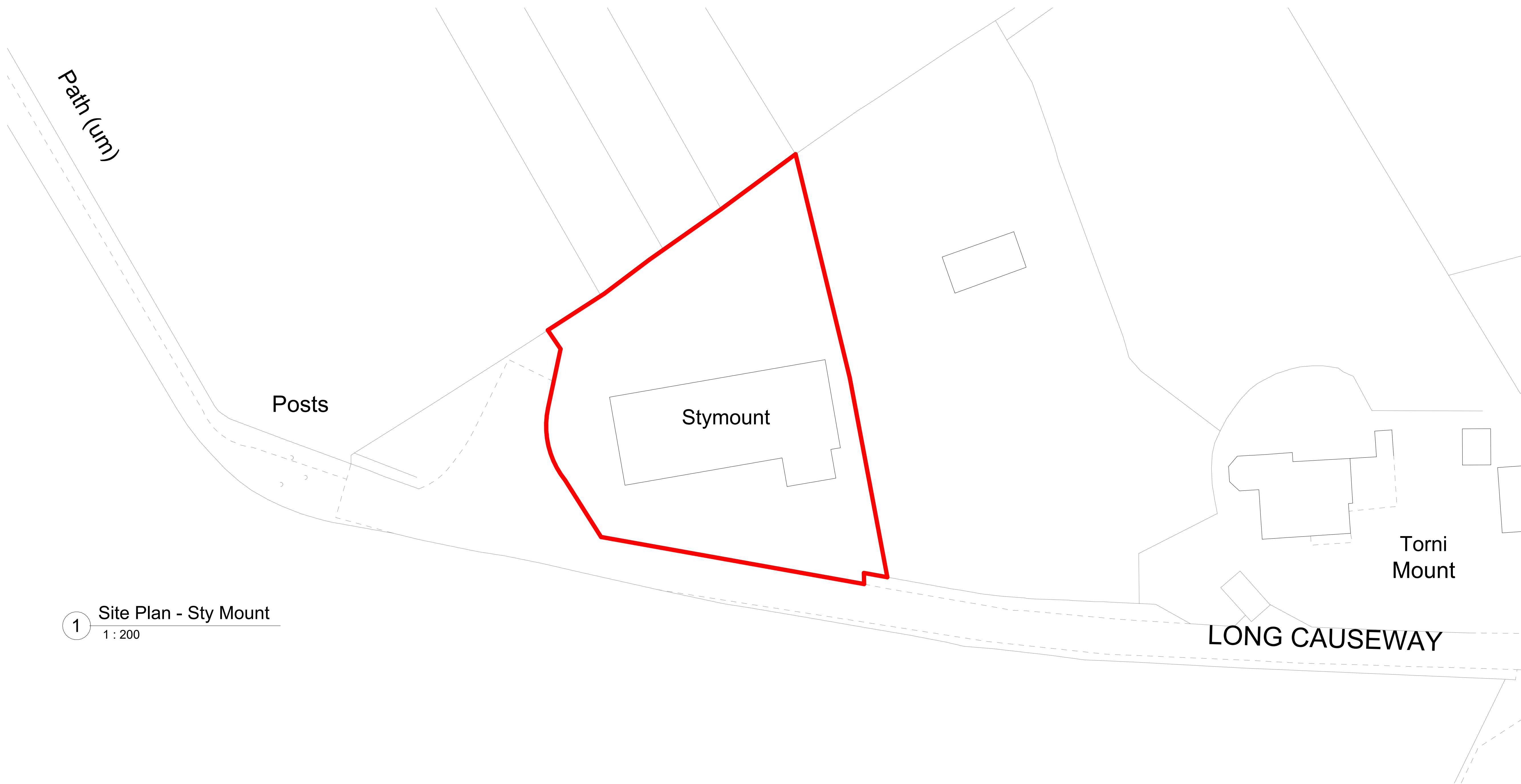
1 Site Plan - Sty Mount 1 : 200