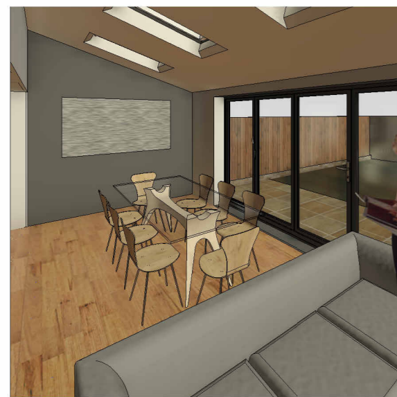
CGI FAMILY / DINING