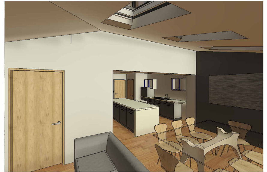
CGI KITCHEN / FAMILY