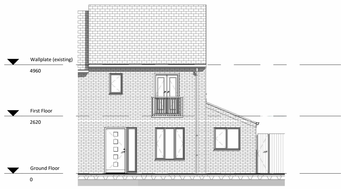
1 11 North Proposed 1 : 100

NOTES - Do not scale from this drawing. - Due to the nature of the project (existing property) dimensions may vary on site to those shown. - The contractor and any specialist designers are responsible for checking all dimensions, tolerances etc before works commence or any materials are ordered / manufactured - Any discrepancies to be referred to the designer. - Refer to structural engineers drawings for all structural elements. Structural elements denoted on this drawing are for information only. - All dimensions are structural i.e. before plaster or other finishes unless stated otherwise - This drawing is copyright of Stonehouse Architectural Ltd and must not be reproduced without authorisation.