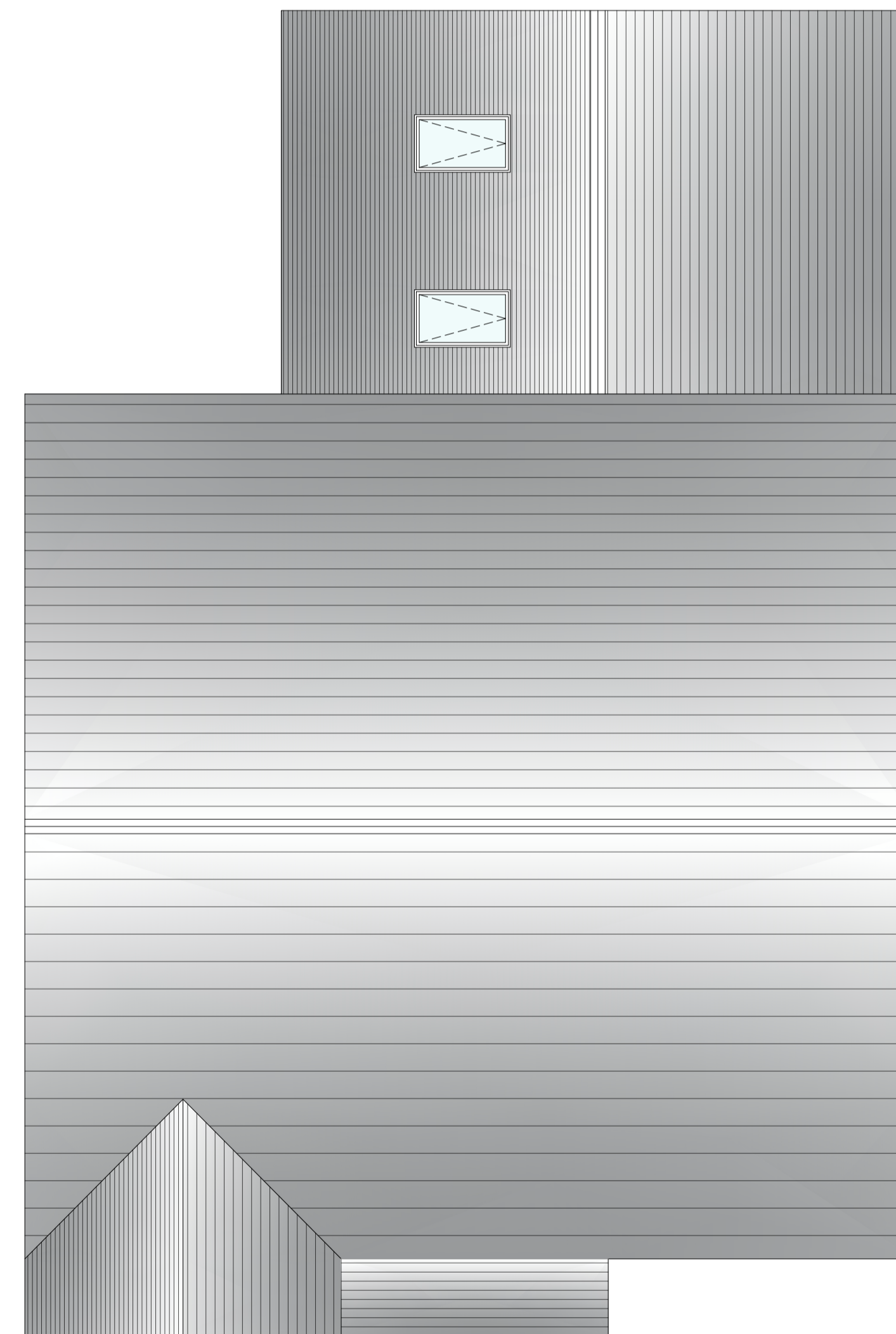
ROOF PLAN 1:50