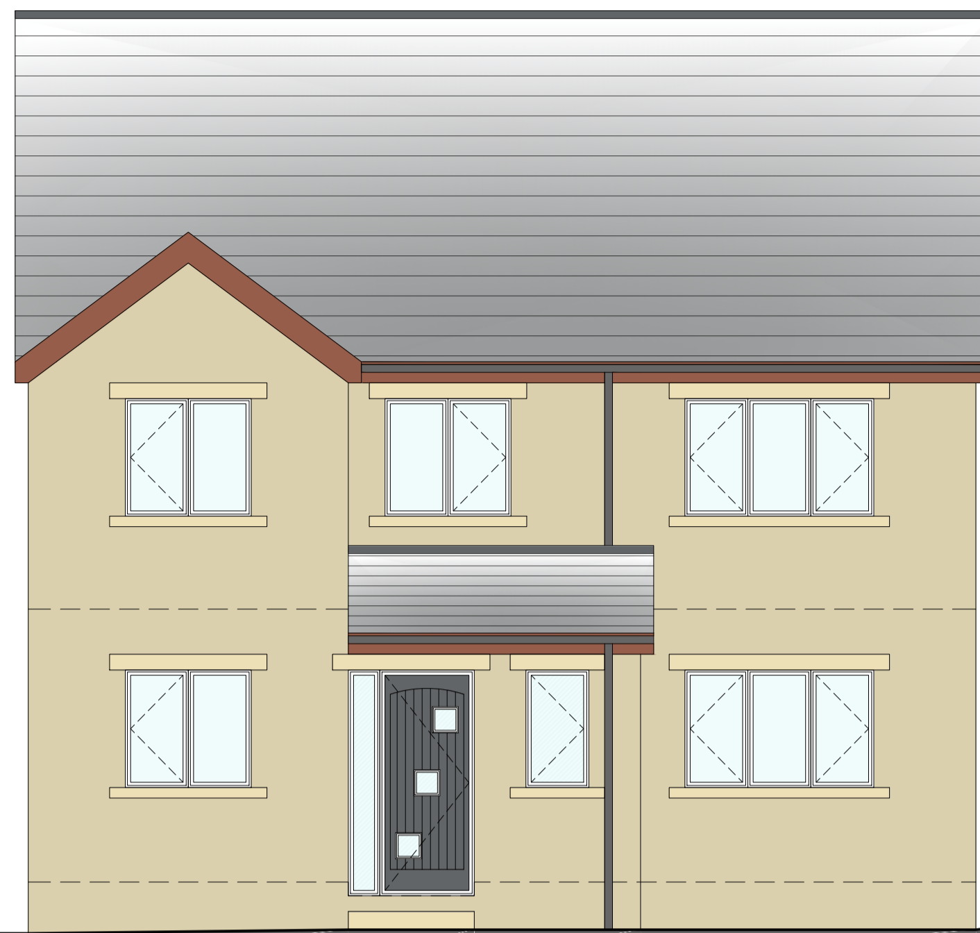
FRONT ELEVATION 1:50