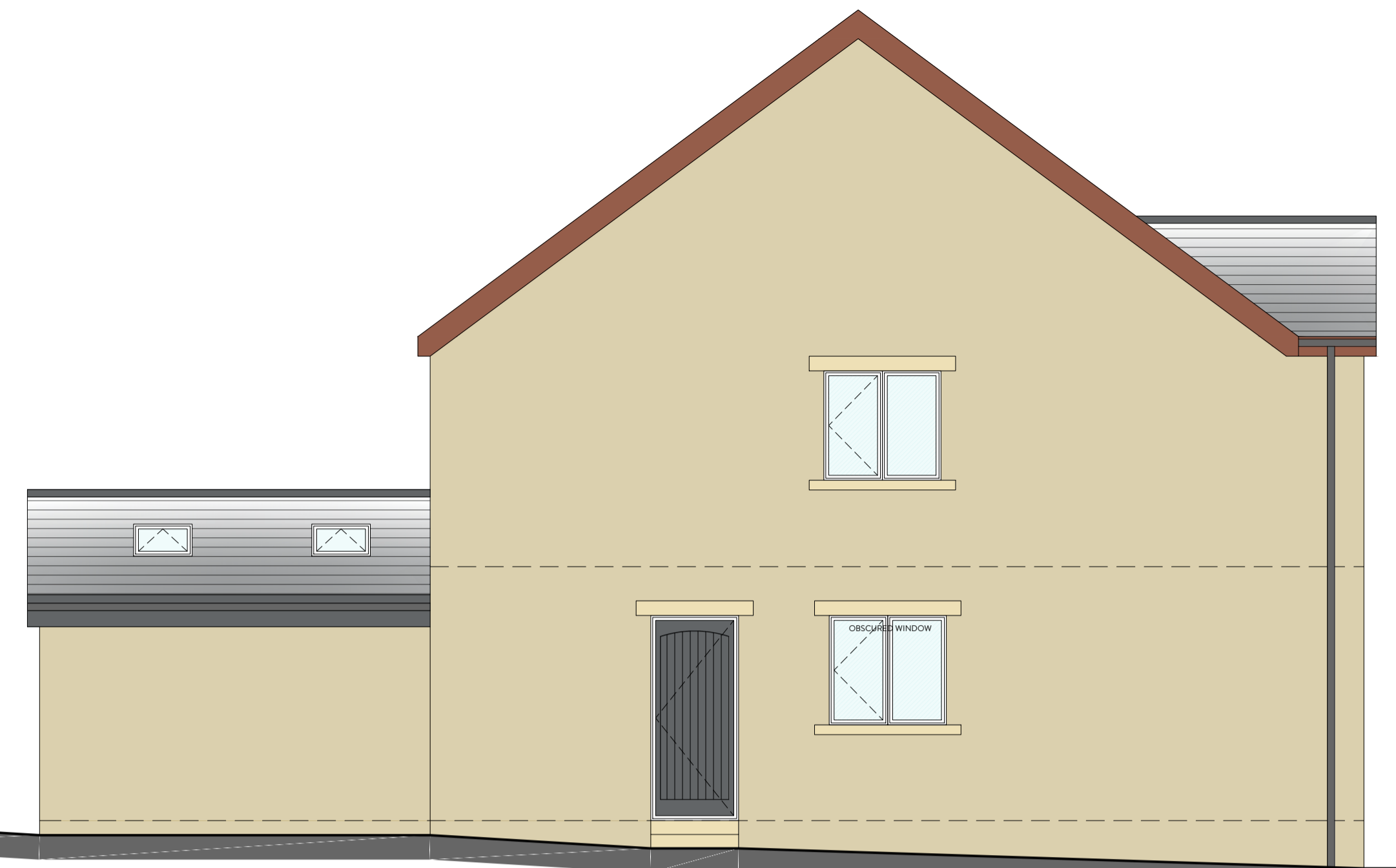
SIDE ELEVATION 1:50