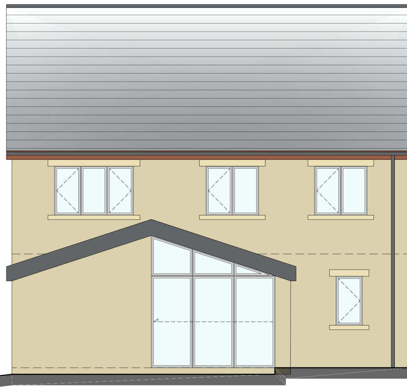
REAR ELEVATION 1:50