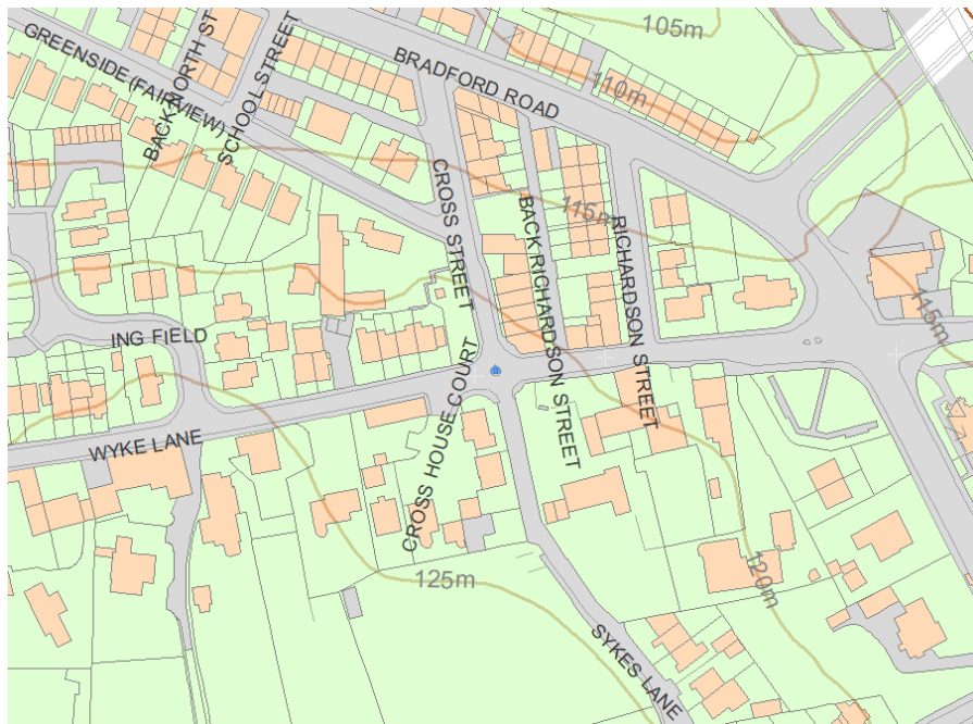
Figure 1 crossroad junction of Wyke Lane, Cross Street, and Sykes Lane at the centre of Oakenshaw

The village is bounded by the M606 motorway to the east and comprises a mix of agricultural land, woodland, residential areas, and industrial estates.