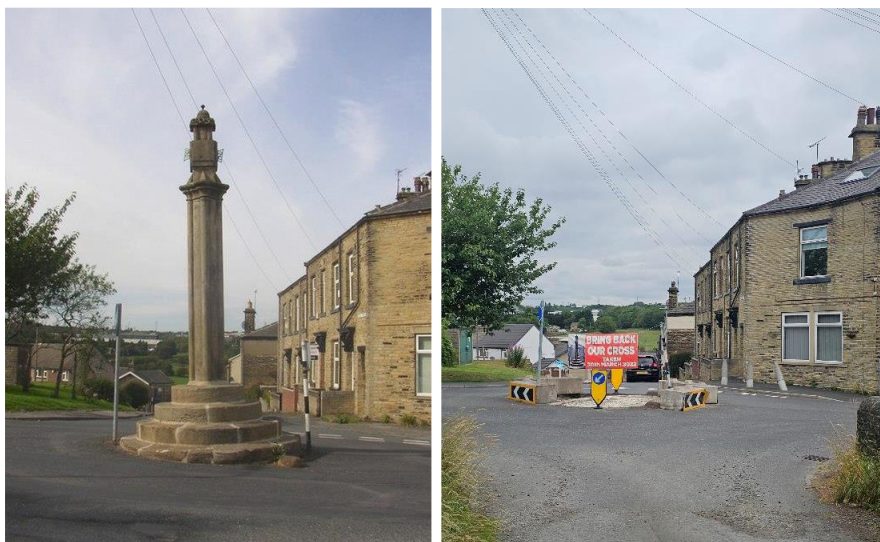
Figure 2 Oakenshaw Cross in situ viewed towards Cross Street (left) and current status of the site with cross removed (right)