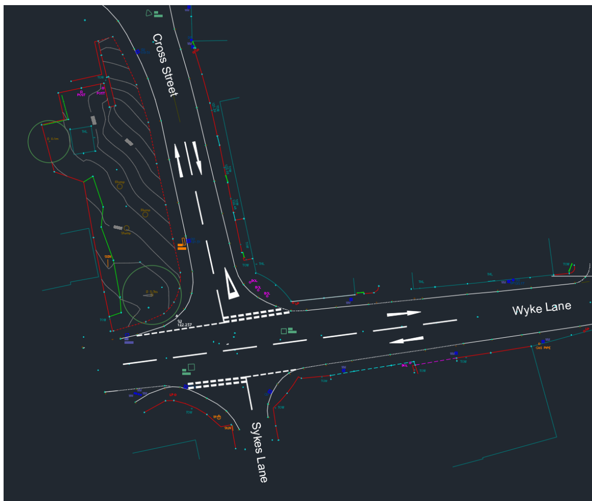
Figure 5: Wyke Lane/Cross Street proposed junction subject to the relocation of the cross

The Highway Authority has no objection to the implementation of the existing priority junction at the intersection of Wyke Lane and Cross Street, subject to the relocation of the cross (as per Figure 5: Wyke Lane/Cross Street proposed junction)