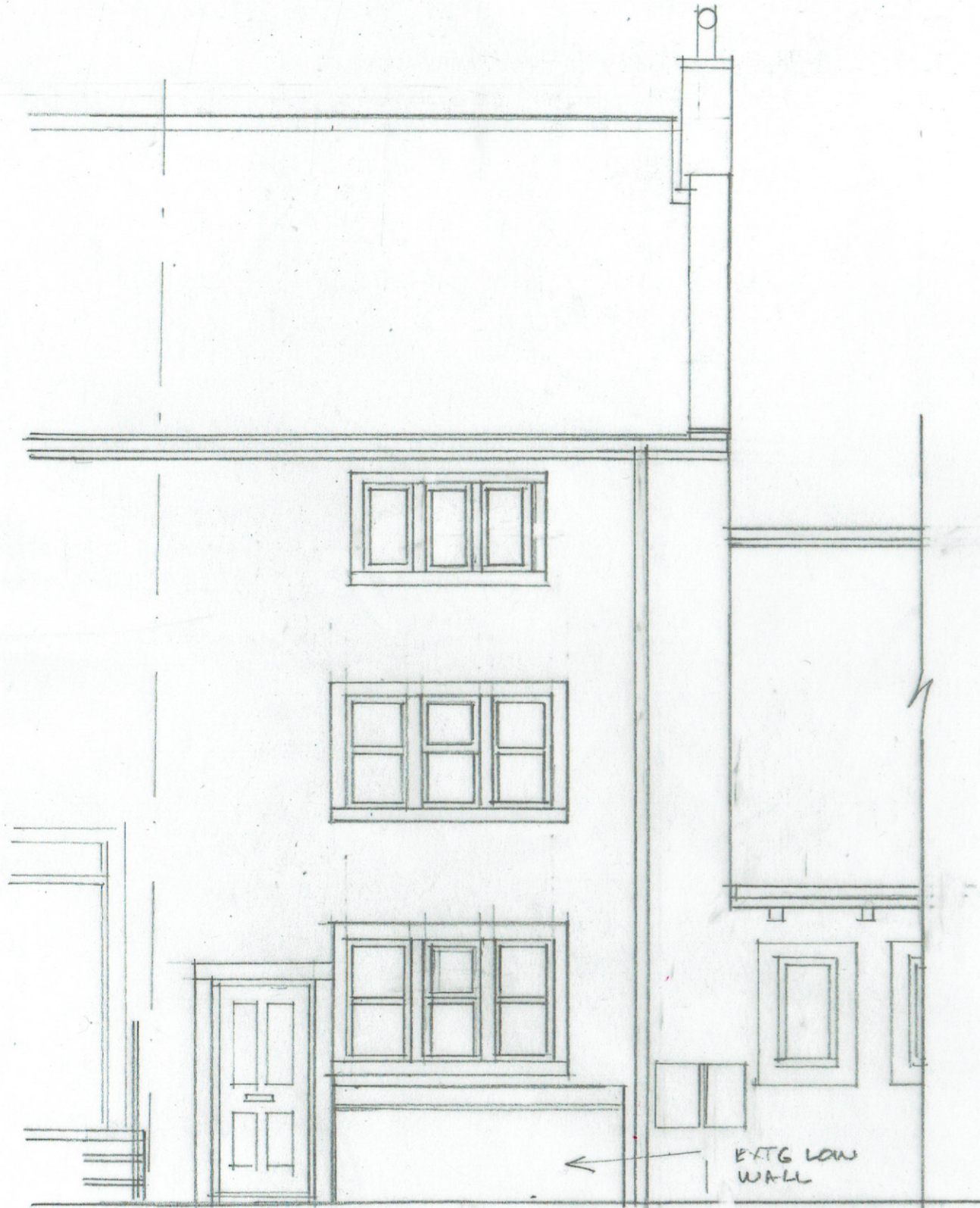
EXISTING NORTH ELEVATION SCALE 1:50