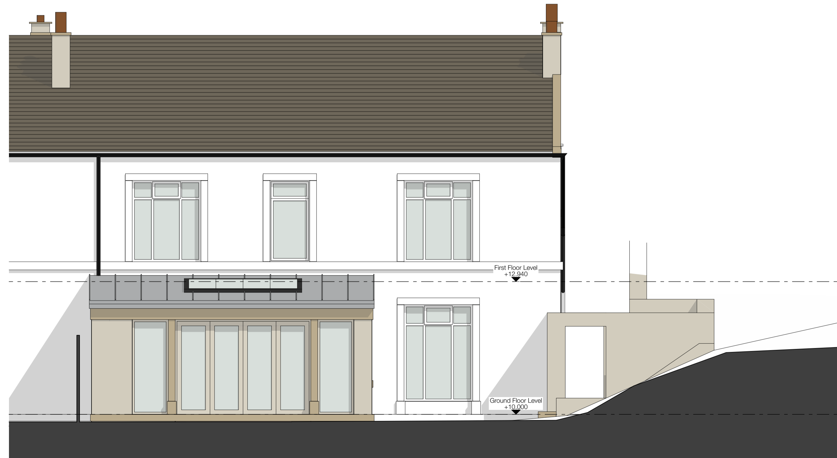
Proposed West Elevation - 1:50