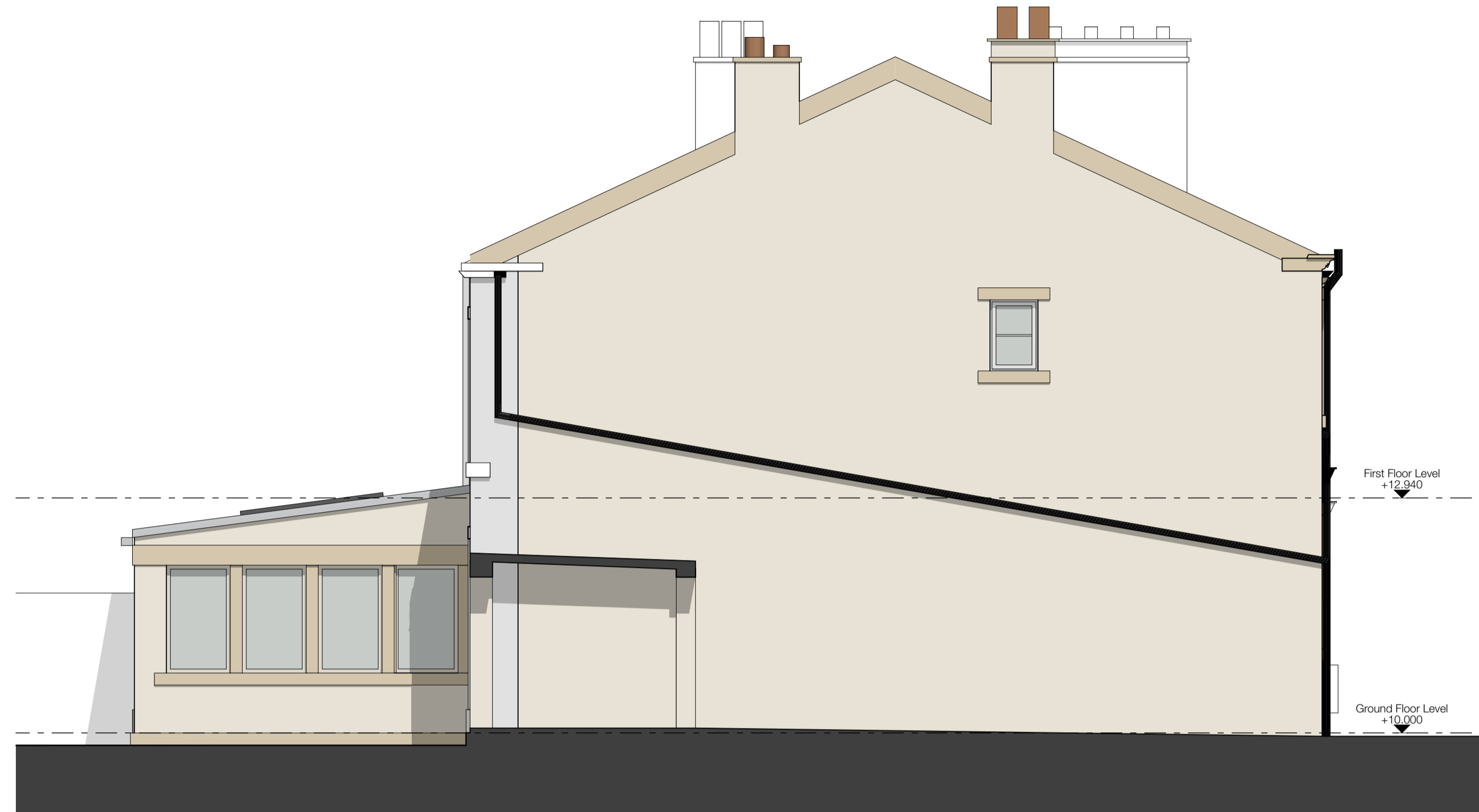
Proposed South Elevation - 1:50