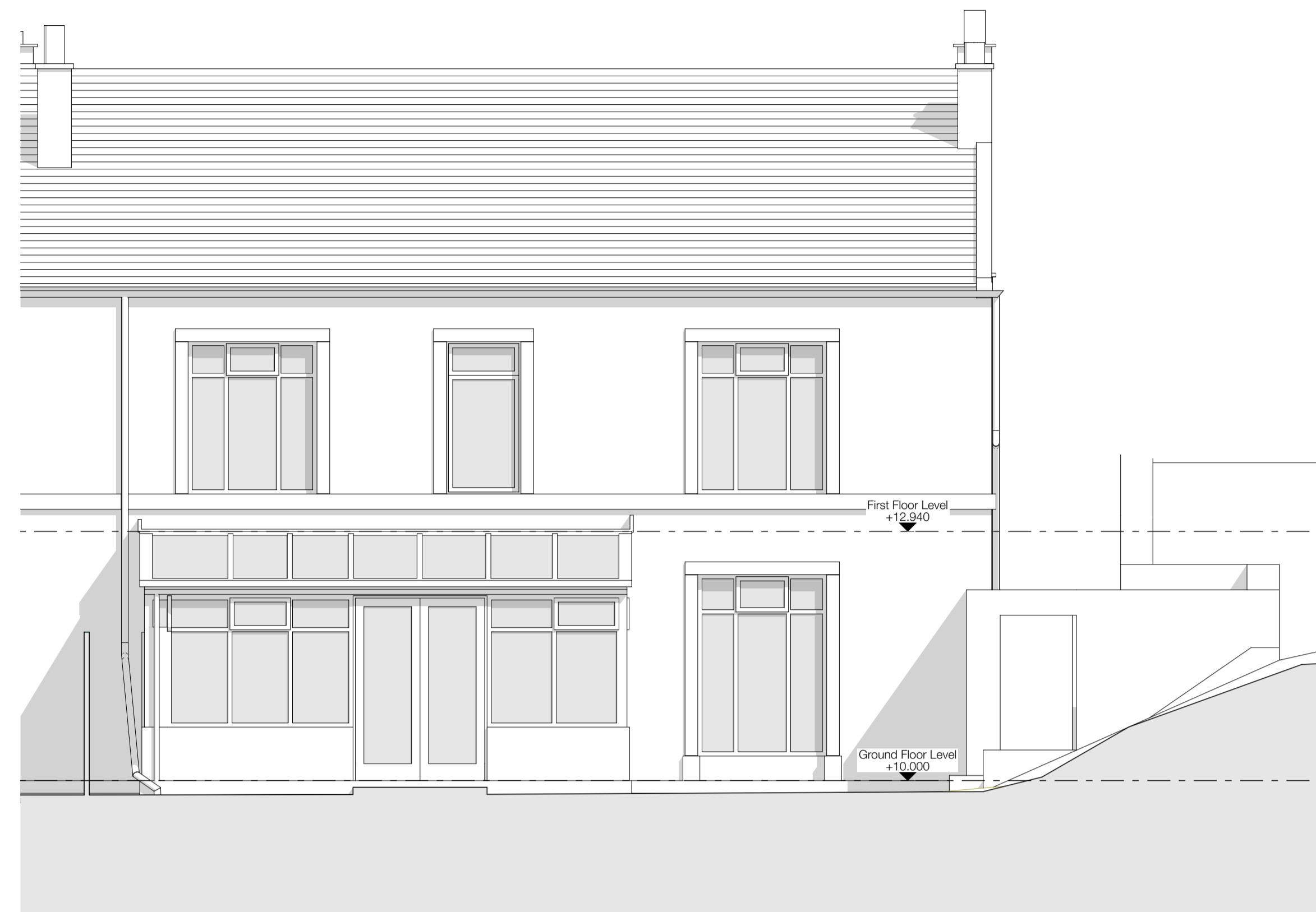
Existing West Elevation - 1:50