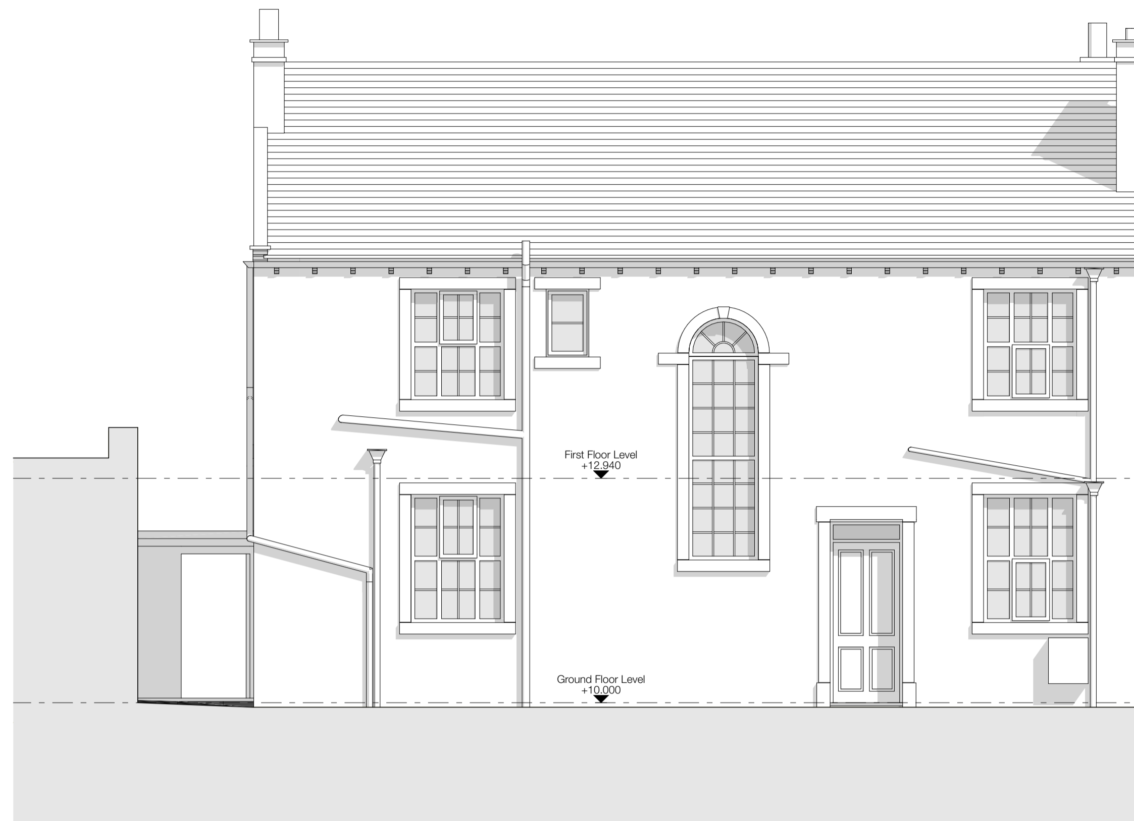
Existing East Elevation - 1:50