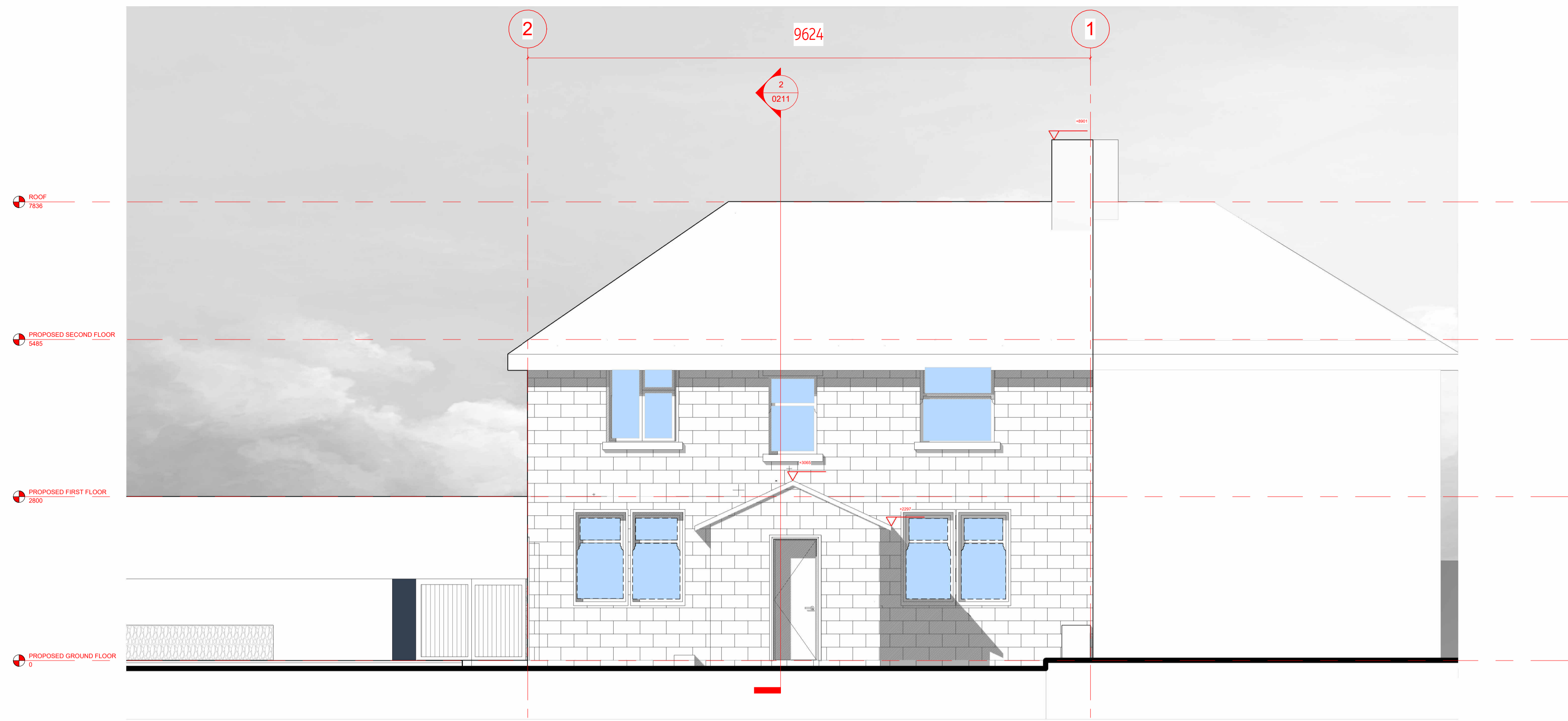
1 ELEVATION 01 1 : 50