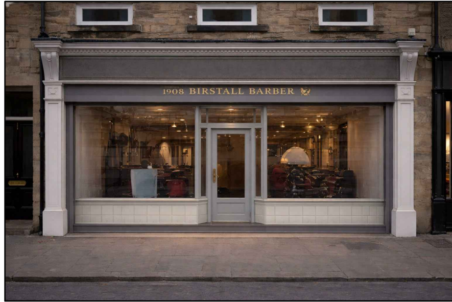
Example of Expected front elevation

The proposal delivers a high-quality traditional shopfront that preserves historic fabric where possible, reinstates appropriate detailing, and enhances the appearance of the listed building and the Birstall Conservation Area, while supporting the continued viable use of the premises as a local business.