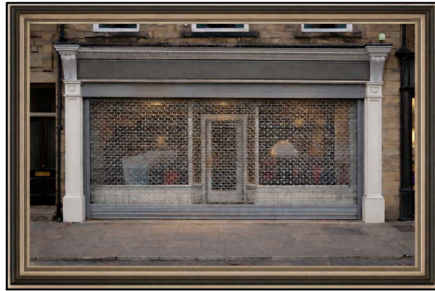
Example of Expected front elevation

The proposal delivers a high-quality traditional shopfront that preserves historic fabric where possible, reinstates appropriate detailing, and enhances the appearance of the listed building and the Birstall Conservation Area, while supporting the continued viable use of the premises as a local business.