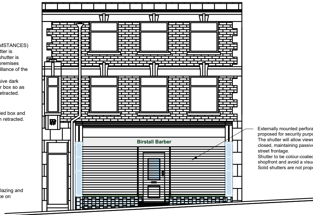
Proposed Front Elevation with Roller Shutter

ALTERNATIVE SECURITY MEASURES The proposal also incorporates laminated glazing and internal security measures to reduce reliance on external security installations.