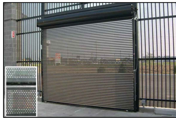
Type of Roller shutter