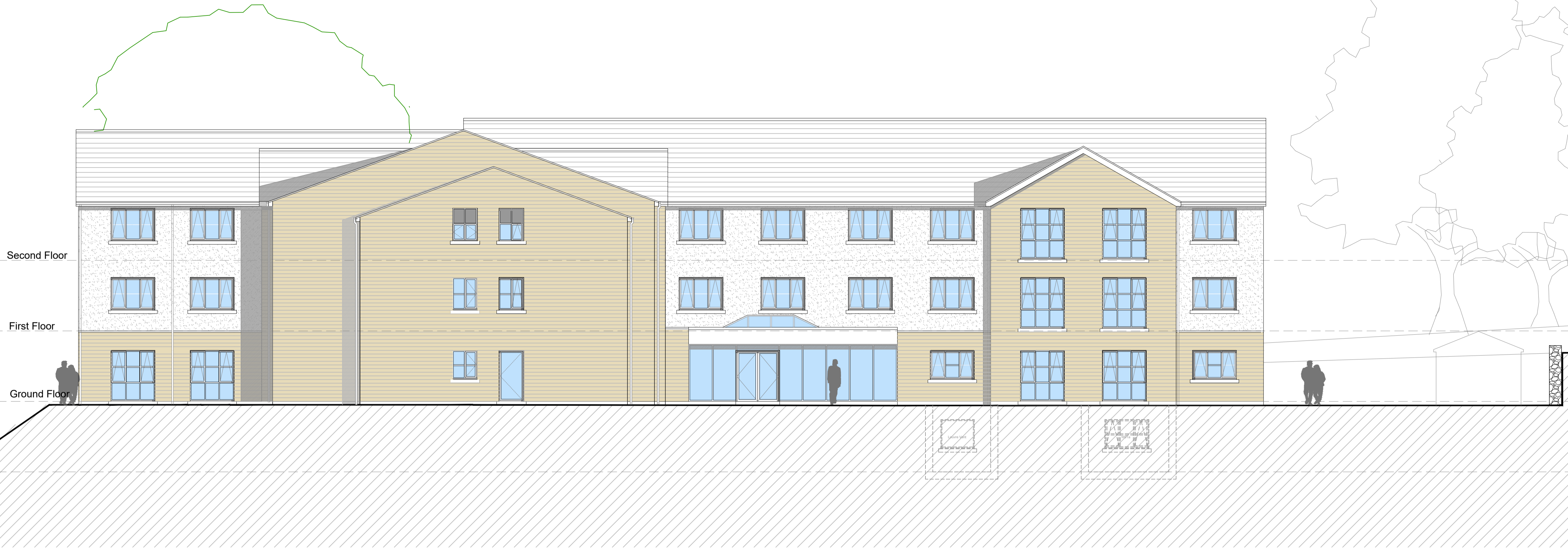
Approved North (Front) Elevation Scale 1:100