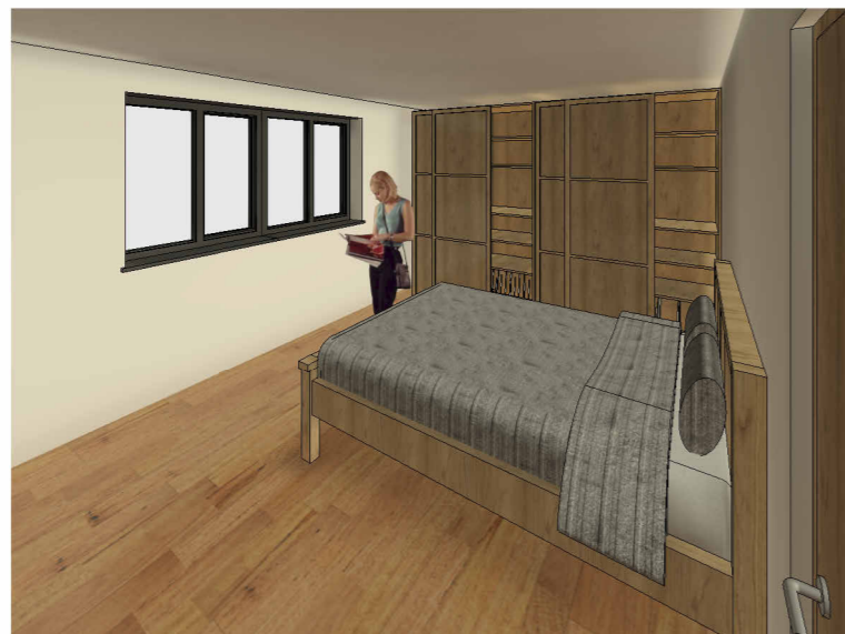
4 Bed 5 CGI

NOTES - Do not scale from this drawing. - Due to the nature of the project (existing property) dimensions may vary on site to those shown. - The contractor and any specialist designers are responsible for checking all dimensions, tolerances etc before works commence or any materials are ordered / manufactured - Any discrepancies to be referred to the designer. - Refer to structural engineers drawings for all structural elements. Structural elements denoted on this drawing are for information only. - All dimensions are structural i.e. before plaster or other finishes unless stated otherwise - This drawing is copyright of Stonehouse Architectural Ltd and must not be reproduced without authorisation.