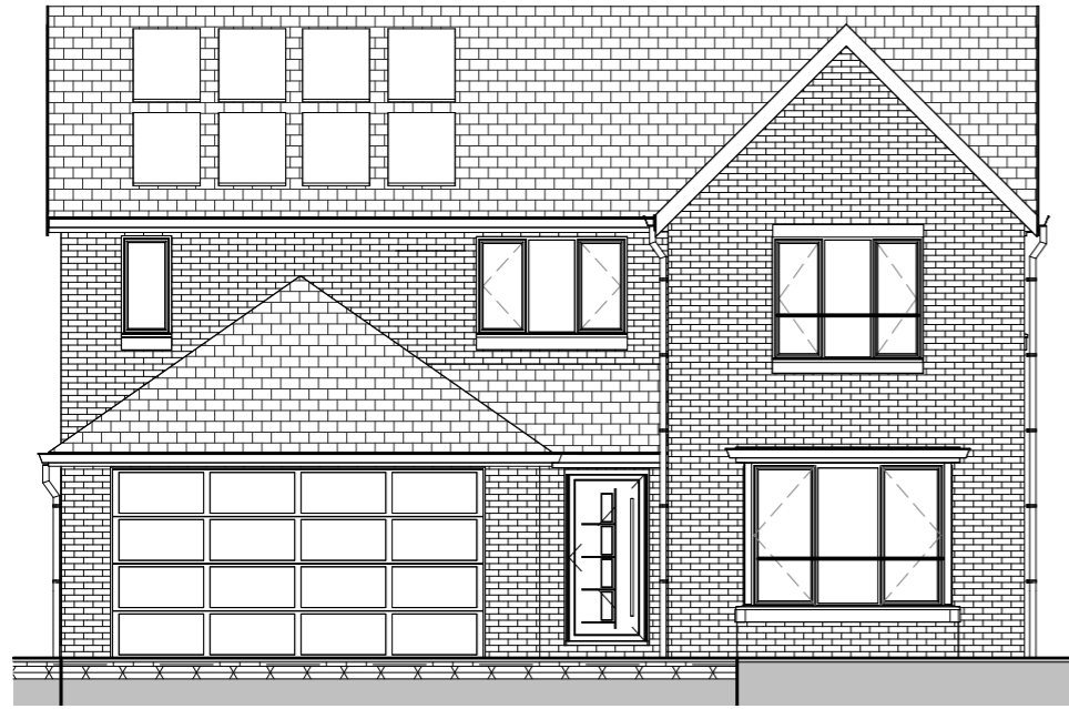
1 10 Existing South Elevation 1 : 100

NOTES - Do not scale from this drawing. - Due to the nature of the project (existing property) dimensions may vary on site to those shown. - The contractor and any specialist designers are responsible for checking all dimensions, tolerances etc before works commence or any materials are ordered / manufactured - Any discrepancies to be referred to the designer. - Refer to structural engineers drawings for all structural elements. Structural elements denoted on this drawing are for information only. - All dimensions are structural i.e. before plaster or other finishes unless stated otherwise - This drawing is copyright of Stonehouse Architectural Ltd and must not be reproduced without authorisation.