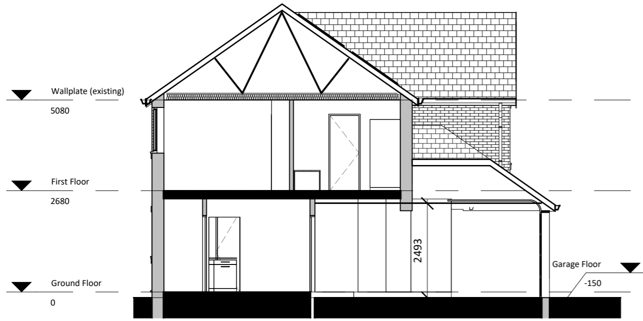
3 Existing Section 1 : 100