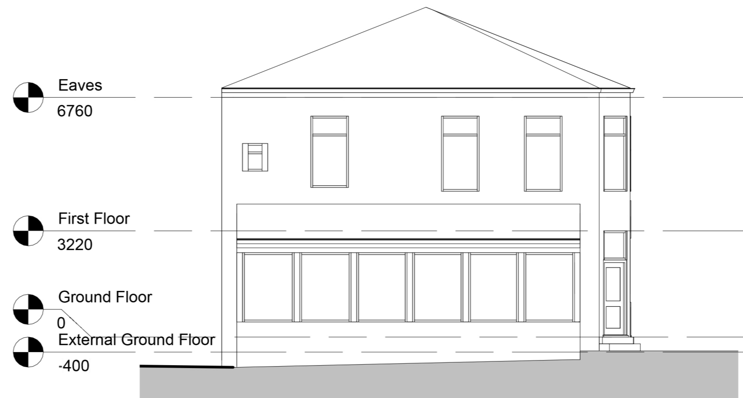
South St Elevation 1 : 100

PROJECT: 94 SAVILE ROAD, DEWSBURY, WF12 9LP DRAWING TITLE: 003 - PROPOSED DESIGN