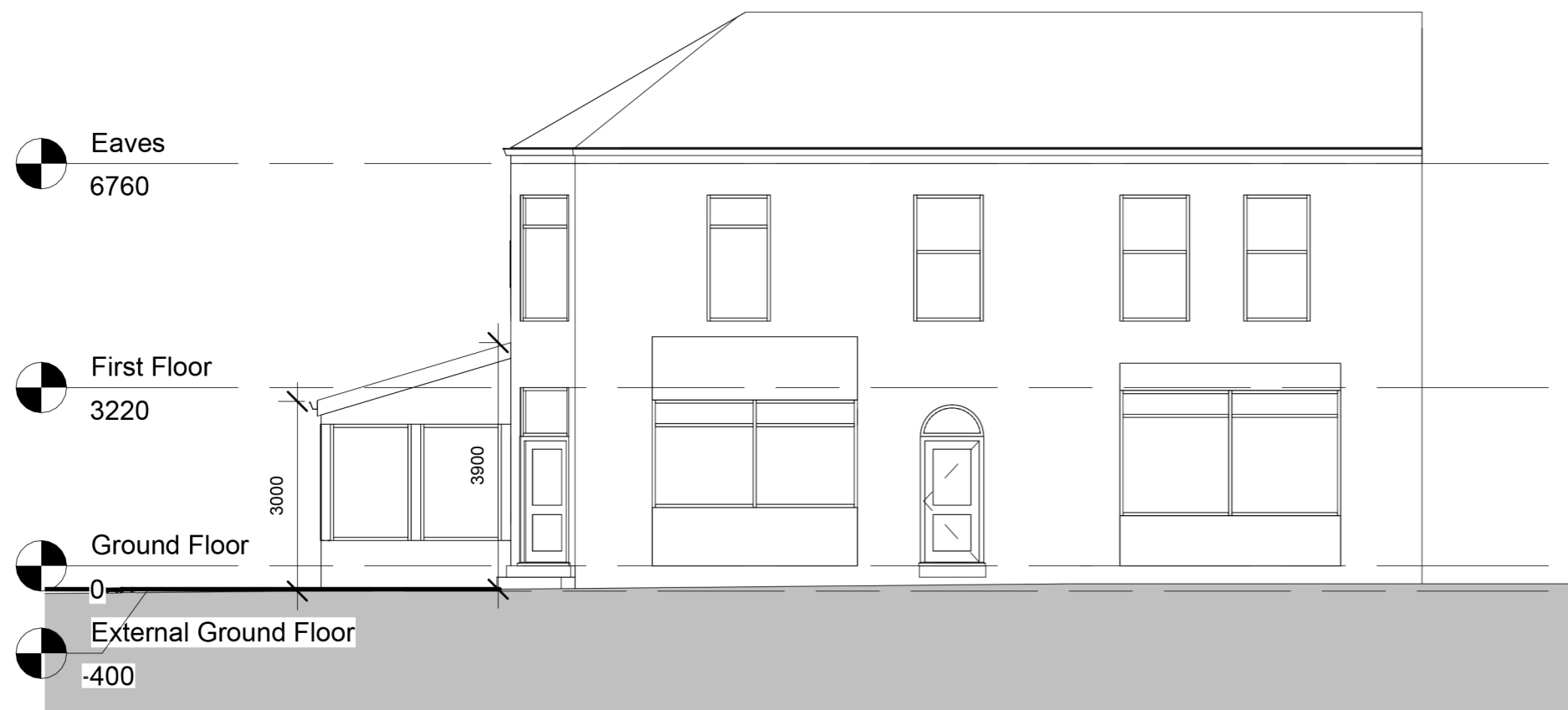
Savile Rd Elevation 1 : 100