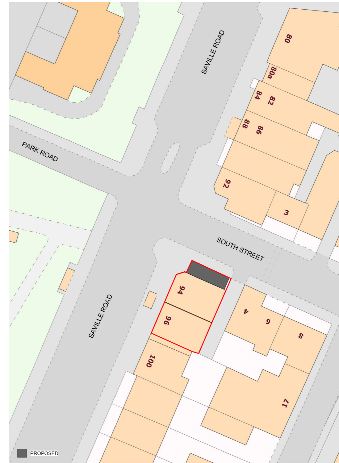
Site Plan 1 : 500