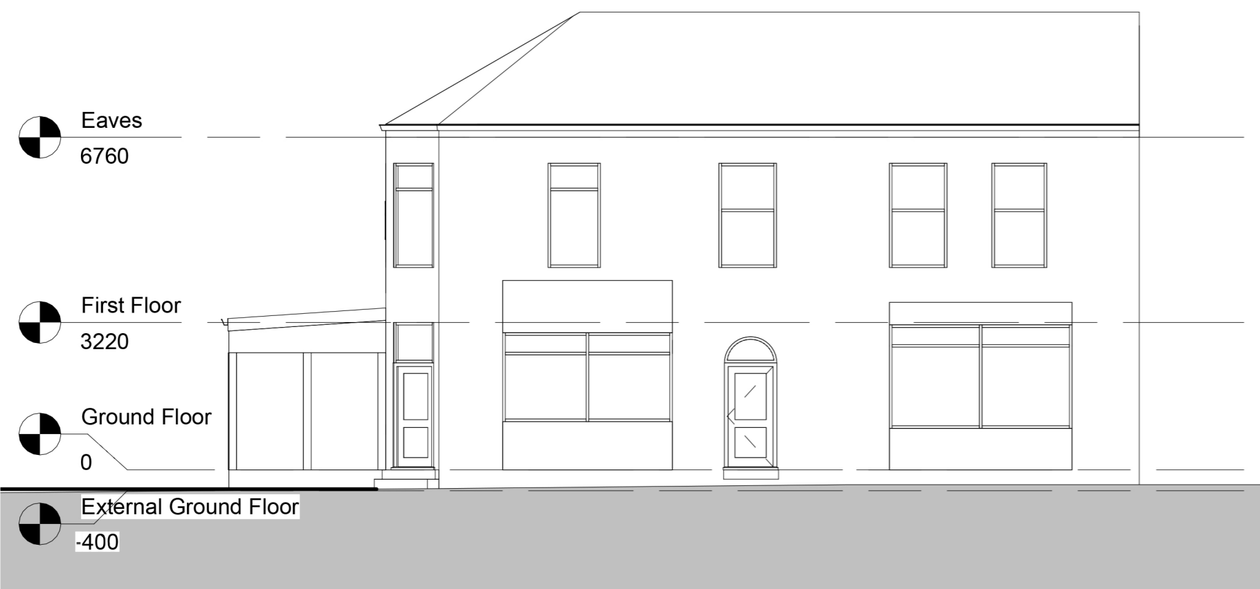
Savile Rd Elevation