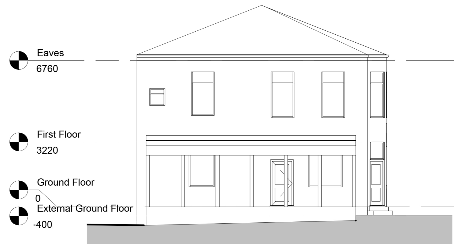
South St Elevation