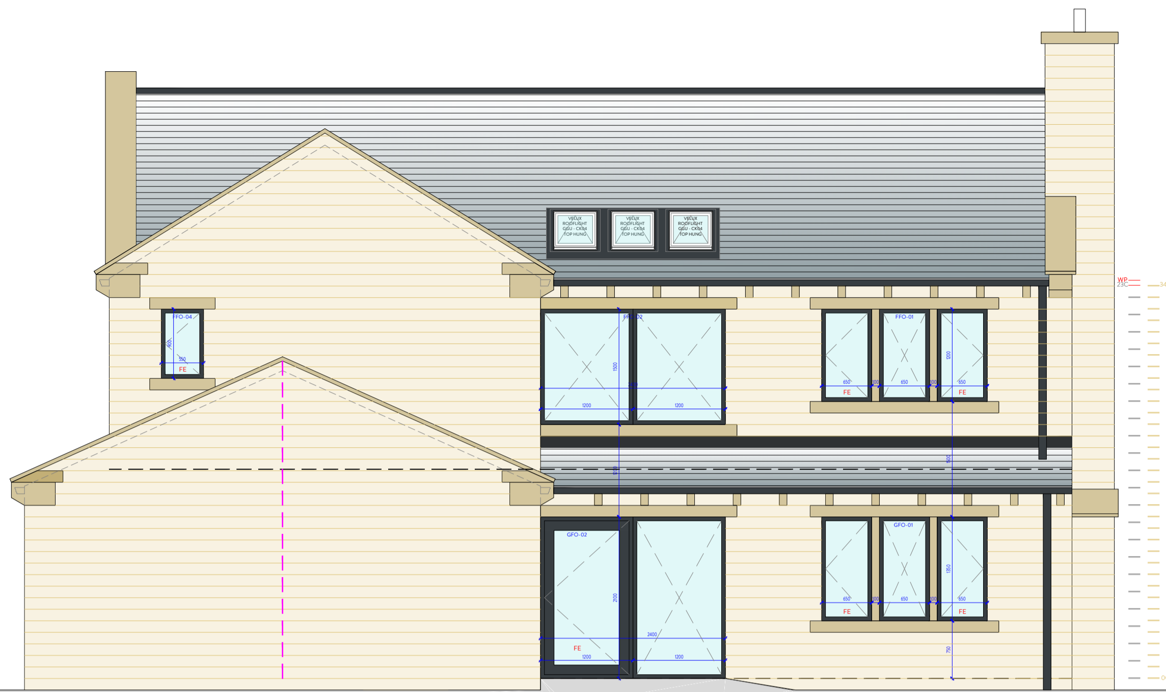
PROPOSED FRONT ELEVATION. 1:50