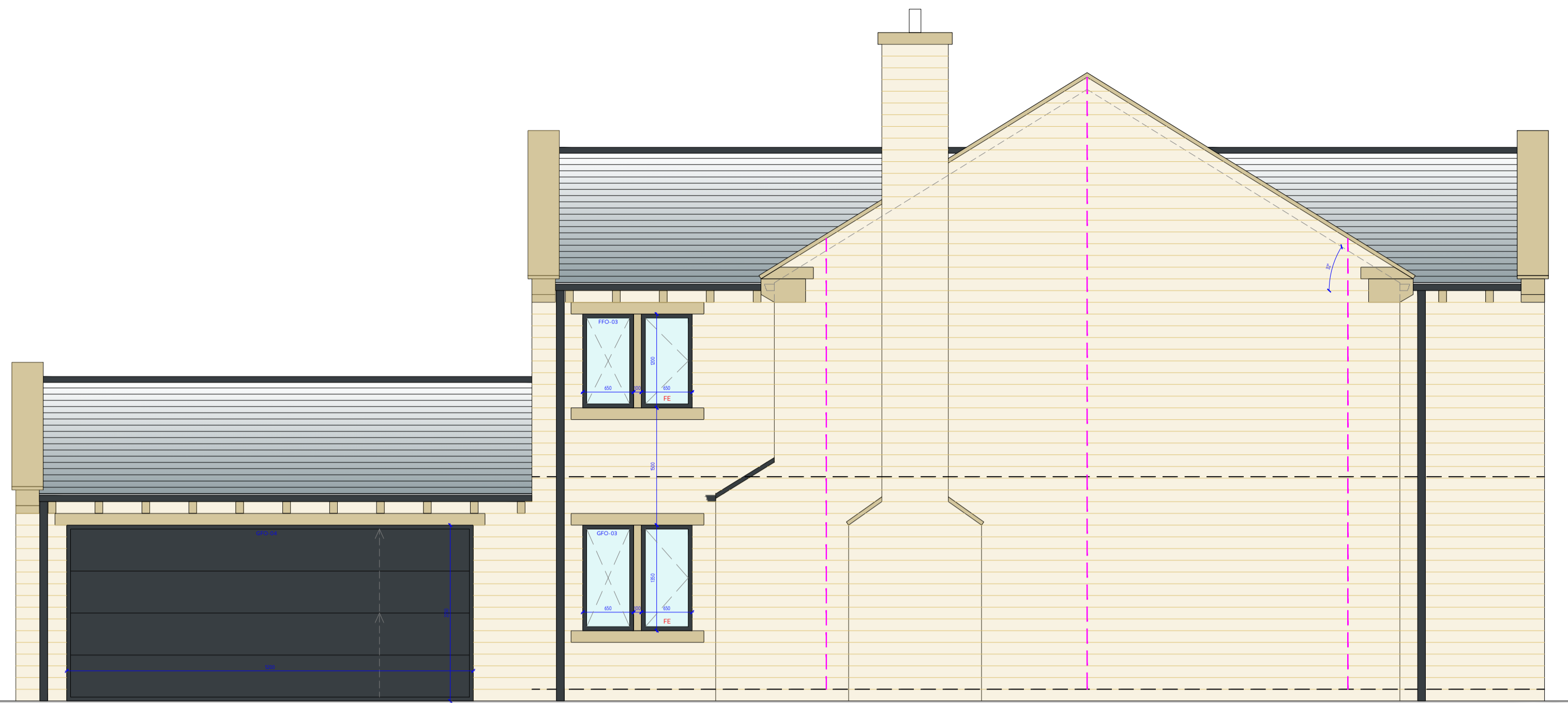
PROPOSED SIDE ELEVATION. 1:50