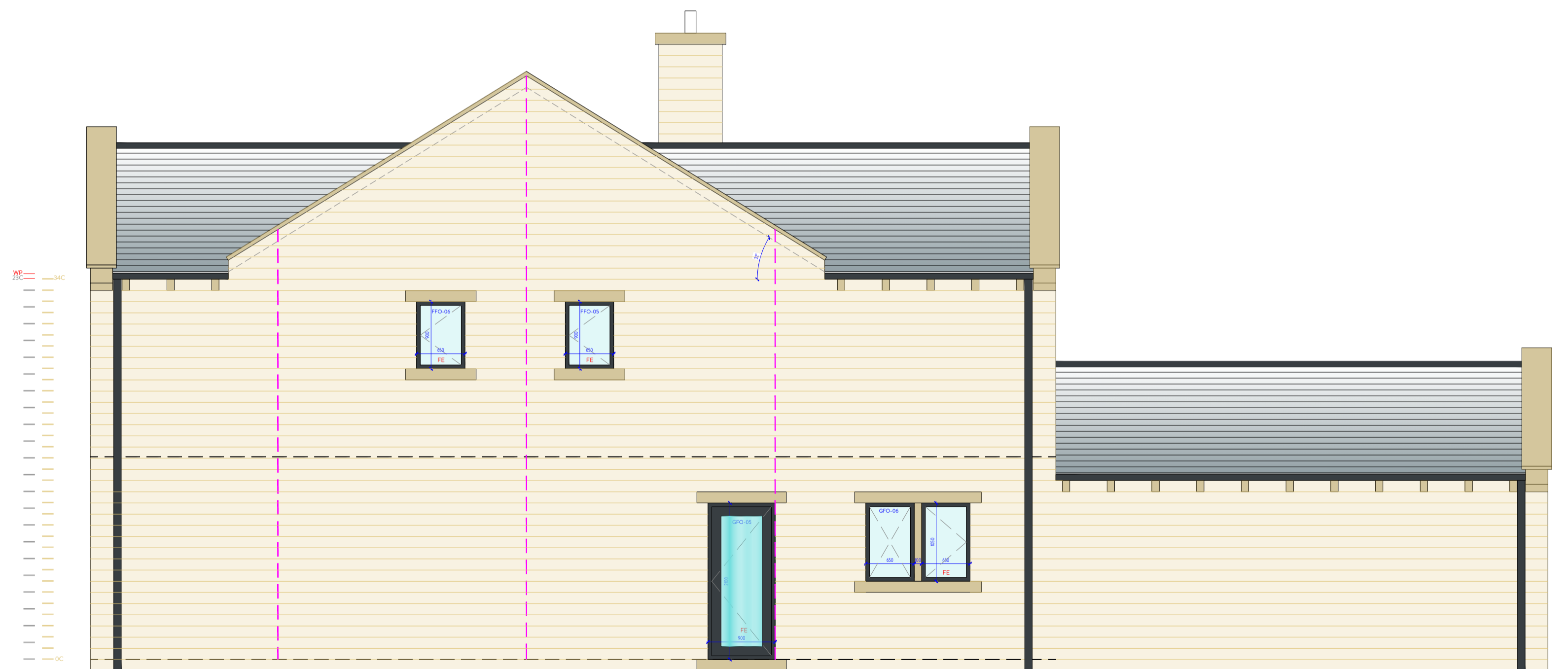
PROPOSED SIDE ELEVATION. 1:50