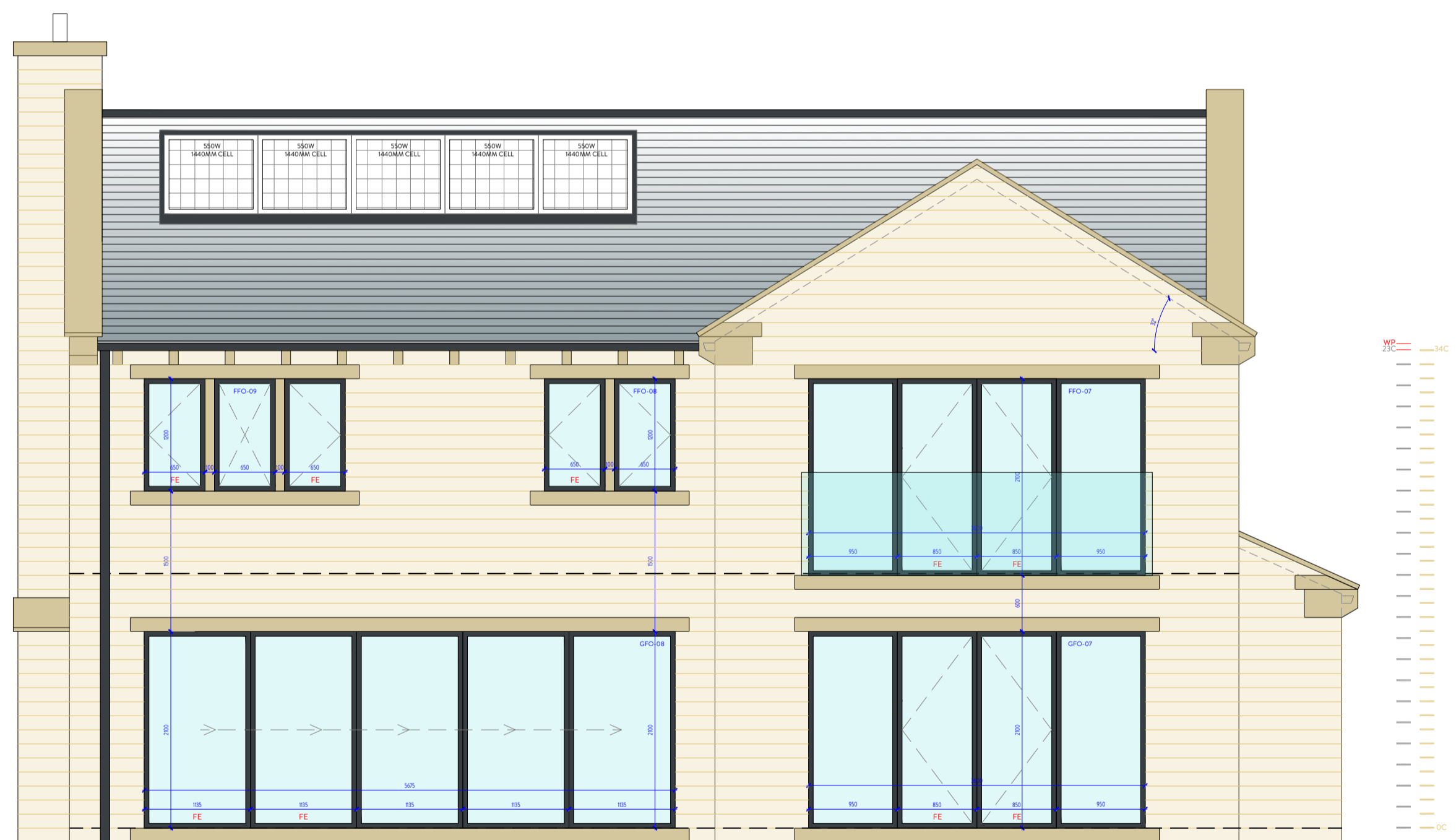
PROPOSED REAR ELEVATION. 1:50