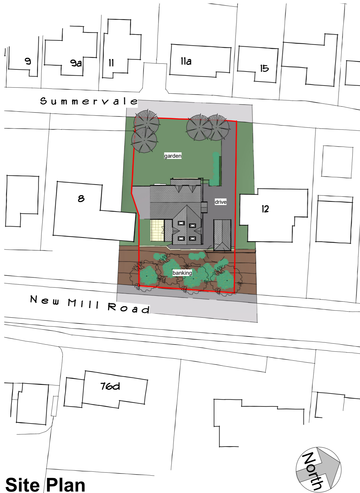
Site Plan 1 : 500