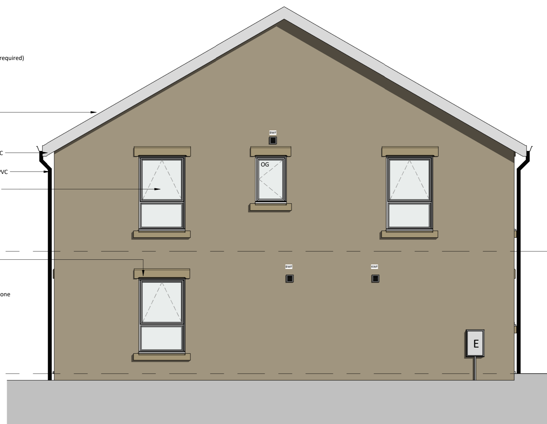
Gable Elevation 1 : 50