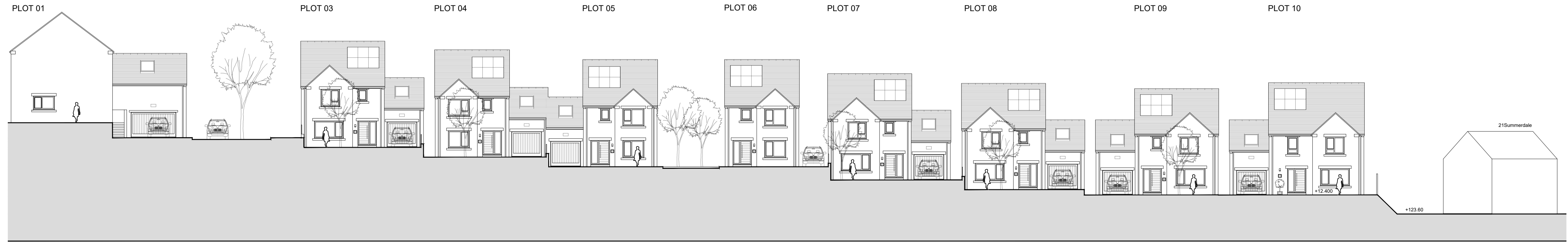
PROPOSED STREET SCENE AA 1:200 @ A1

Rev G : 29.04.2026 : Materials removed and street scene updated to coordinate with the plan Rev F : 12.04.2026 : Highway layout updated Rev E : 08.03.2026 : Conservatory added to adjacent plot and street scene updated. Materials confirmed Rev D : 09.02.2026 : Plot 03 and 10 amended to buff brickwork Rev C : 29.01.2026 : Plot 01 and 02 amended to stone Rev B : 18.12.2025 : Street scene updated to show lowered garages and material changed to brickwork Rev A : 16.11.2025 : Hedge to the front of plot 10 moved to the boundary