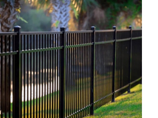
PROPOSED BOUNDARY TREATMENT & MATERIALS 1:250 @ A1