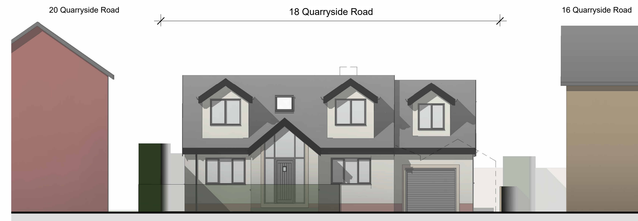
PROPOSED SITE SECTION BB 1:100