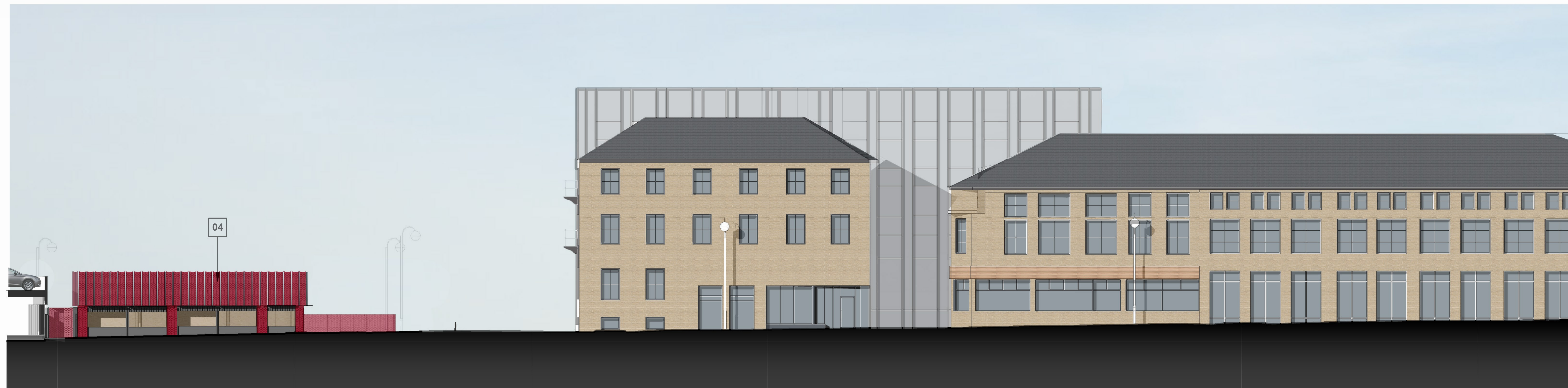
3 Lord Street Proposed Section 1 : 200