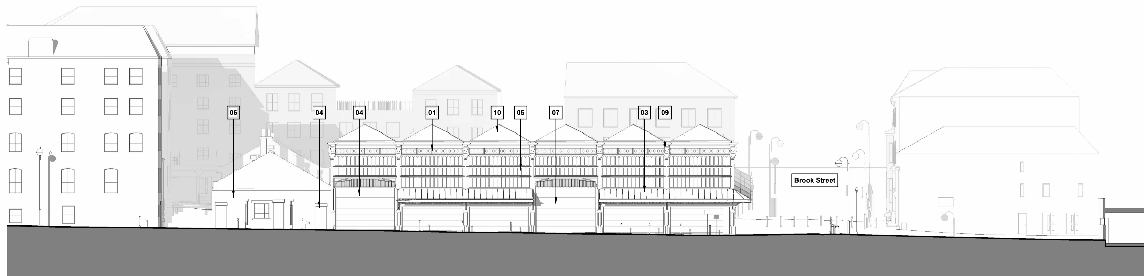
2 Lord Street Section 1 : 200