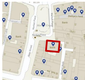
Location Map Showing Surrounding Heritage Assets