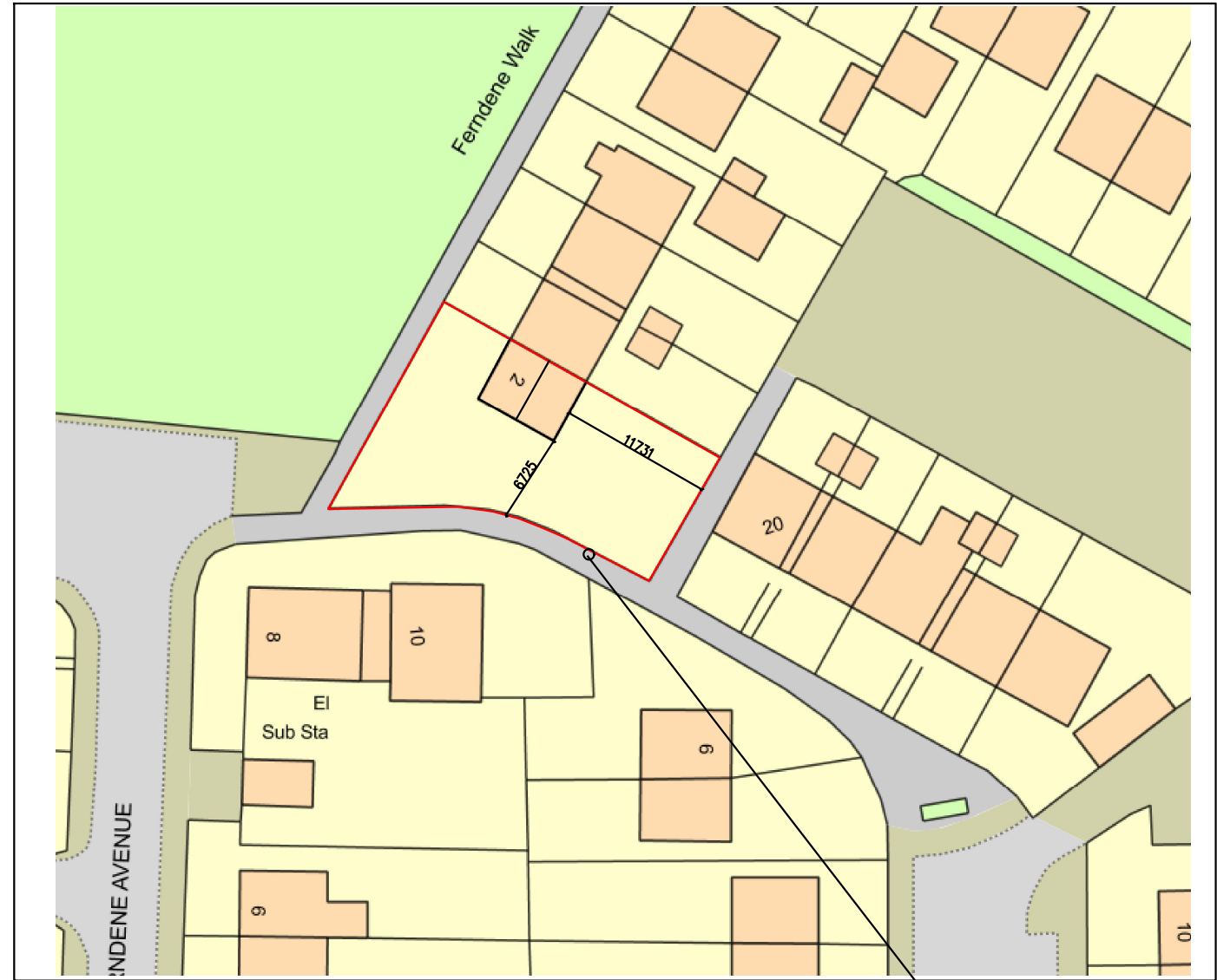
Existing Site Plan 1:500