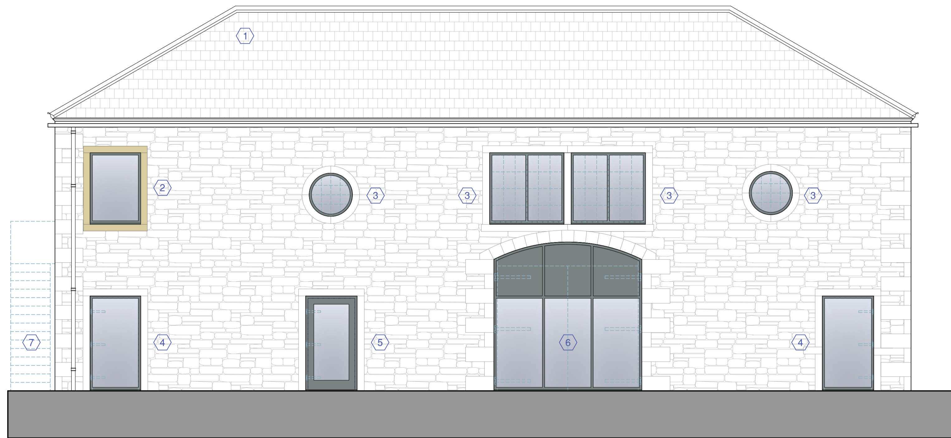
1 EAST ELEVATION AS PROPOSED SCALE 1:50