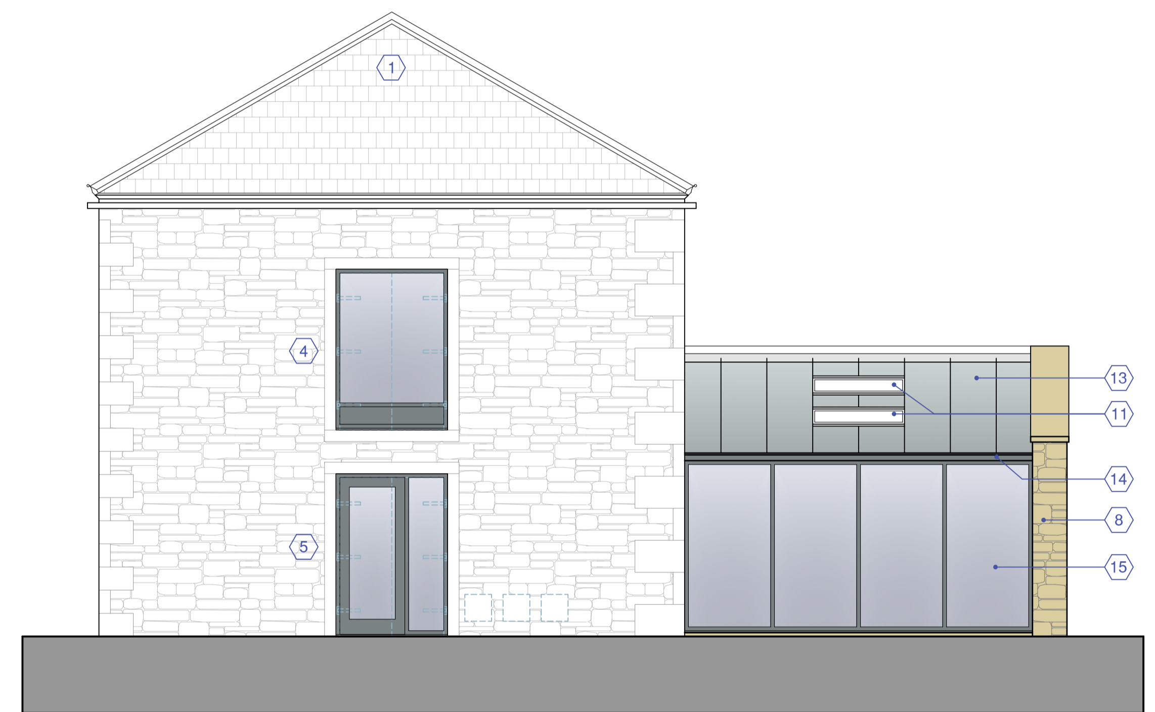
4 NORTH ELEVATION AS PROPOSED SCALE 1:50