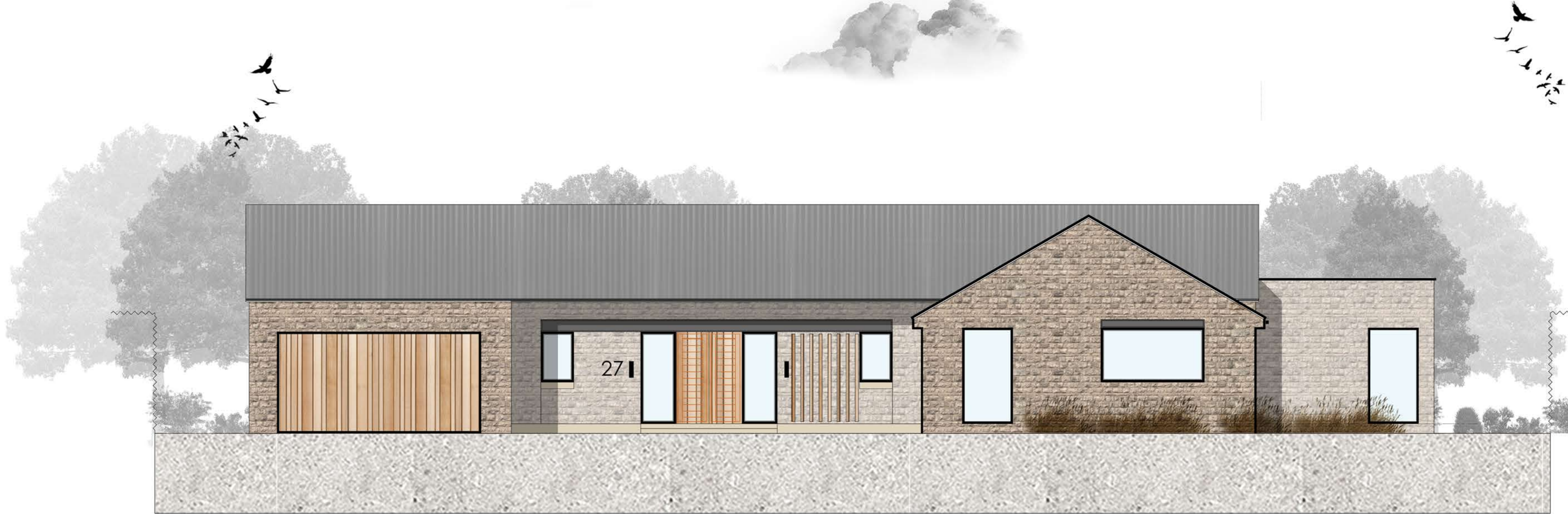
FRONT ELEVATION [Facing North] AS PROPOSED Scale 1:50

Note: Information is based on OS map and received information and is subject to full topographical survey. Assumed site boundary and site constraints subject to legal confirmation. All legal easements and extent of existing underground services locations are subject to confirmation.