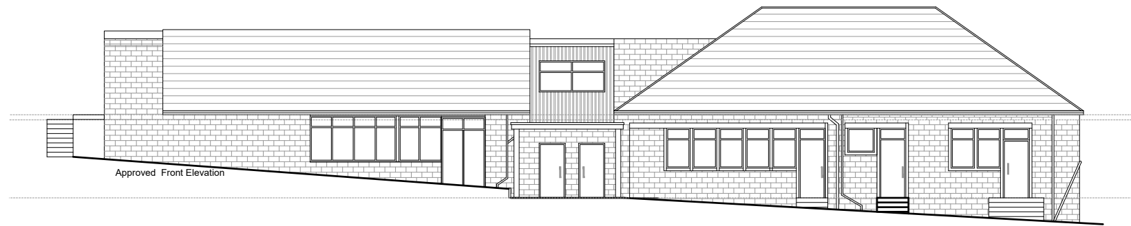
Approved Front Elevation