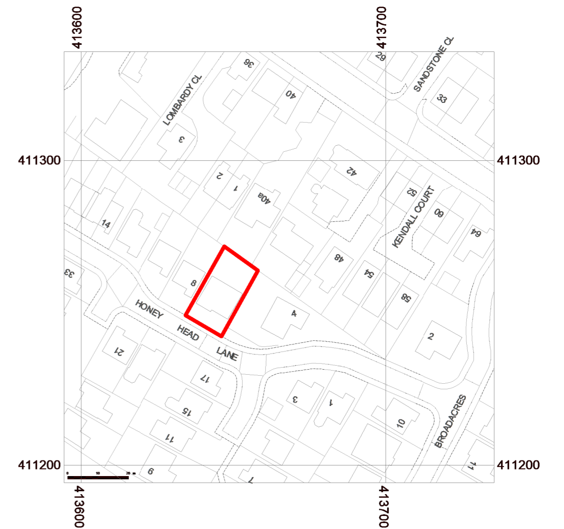
3 Location Plan 1 : 1250