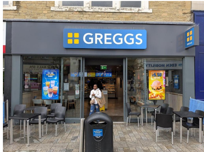
GREGGS, 39 New Street Large digital screens within shopfront windows. Internally illuminated signage.