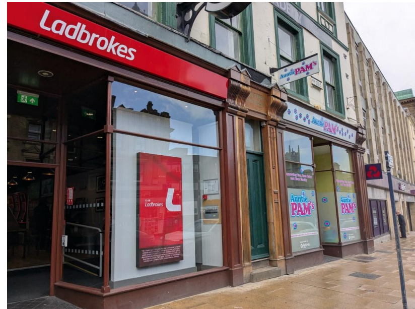
LADBROKES, 4 New Street Large digital screen within shopfront window. Internally Illuminated signage.