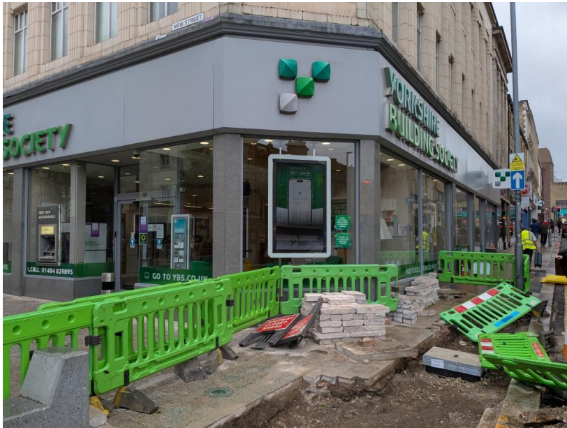
YORKSHIRE BUILDING SOCIETY, 22-24 New Street Large digital screen within shopfront window. Internally Illuminated signage.

As part of our assessment of the building's context we have reviewed other examples of advertisement and signage within windows of nearby properties at Market Place area. We have selected examples which are either of a similar building type or similar signage type, or both.