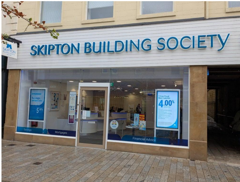
SKIPTON BUILDING SOCIETY, 50 New Street Large digital screens within shopfront windows. Externally and halo illuminated signage.