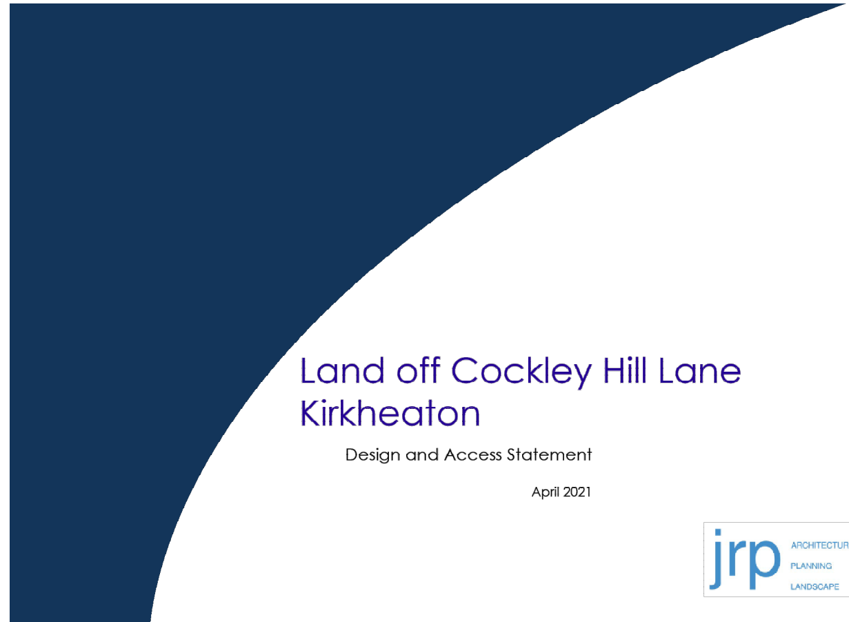
Figure 1 - Front cover of the Design and Access Statement relating to existing planning approval

1.1.5 This addendum sets out how the proposals of this application tie in as closely as possible to the existing planning approval and highlight where any variations exist.