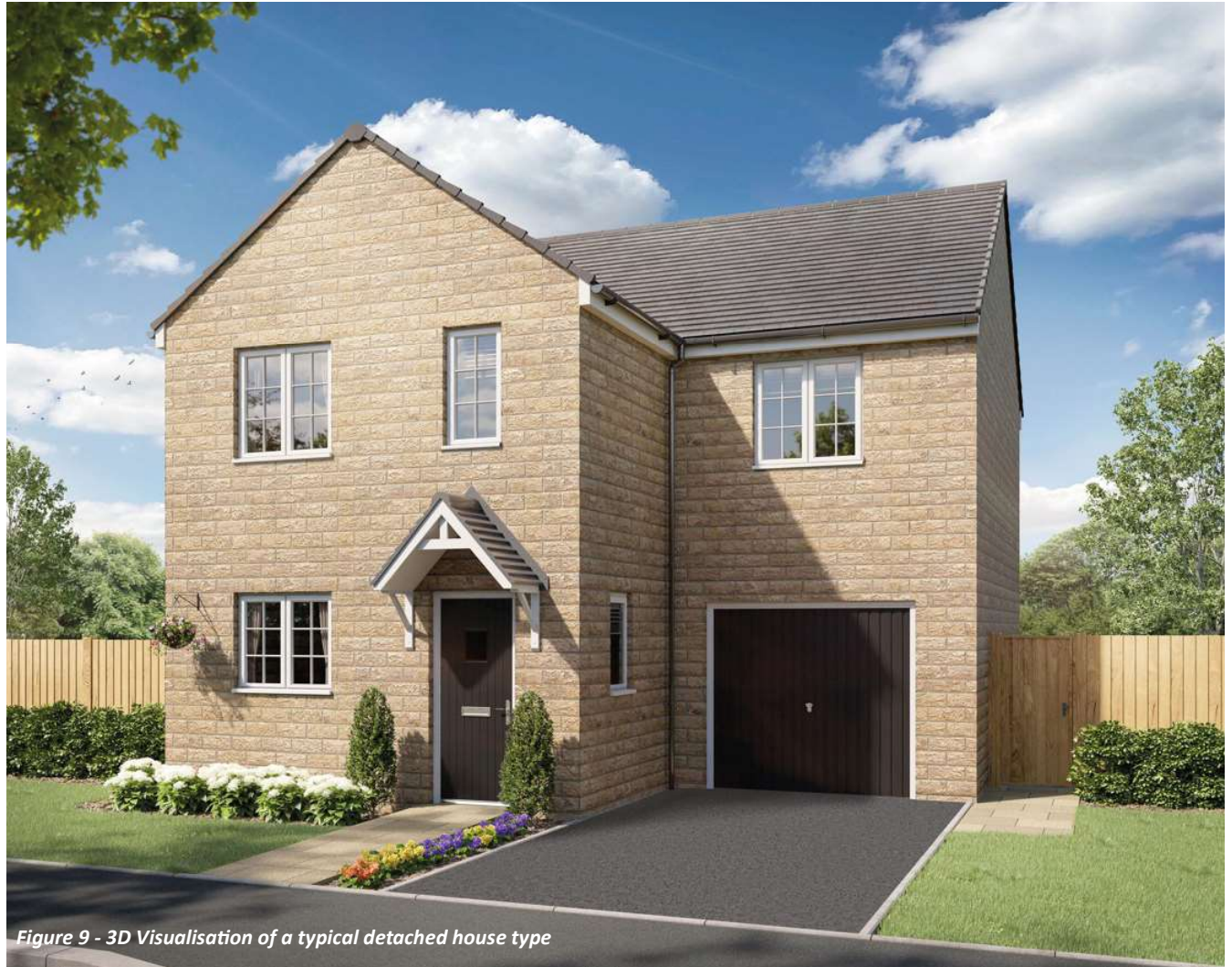
Figure 9 - 3D Visualisation of a typical detached house type

5.1.3 In light of the documentation submitted in support of this application it is considered that consent should be granted for the proposed development.