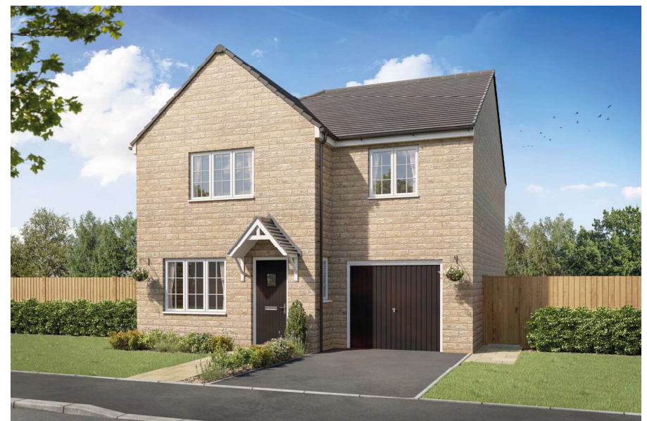
Figure 8 - 3D Visualisation of a typical detached house type