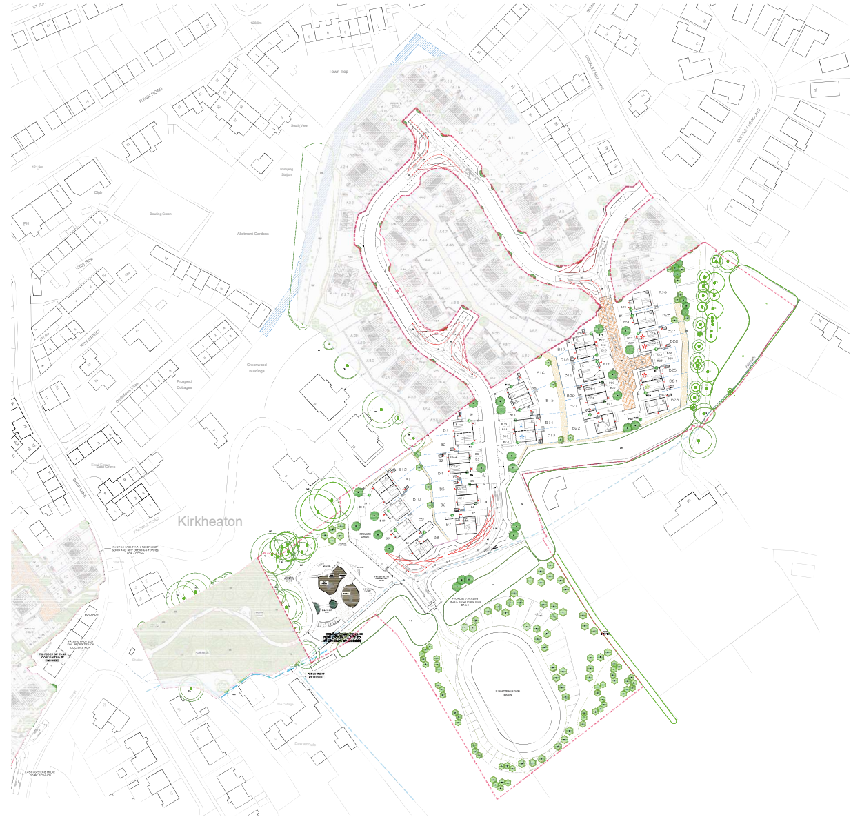
Figure 2 - Proposed Site Layout (P19:5336:03) of existing planning approval (2021/62/92527/W)

2.1.4 There is a Drainage Attenuation Basin in the southern most section of the site and a pedestrian route though an area of Public Open Space which leads to Orchard Road and Shop Lane to the west.