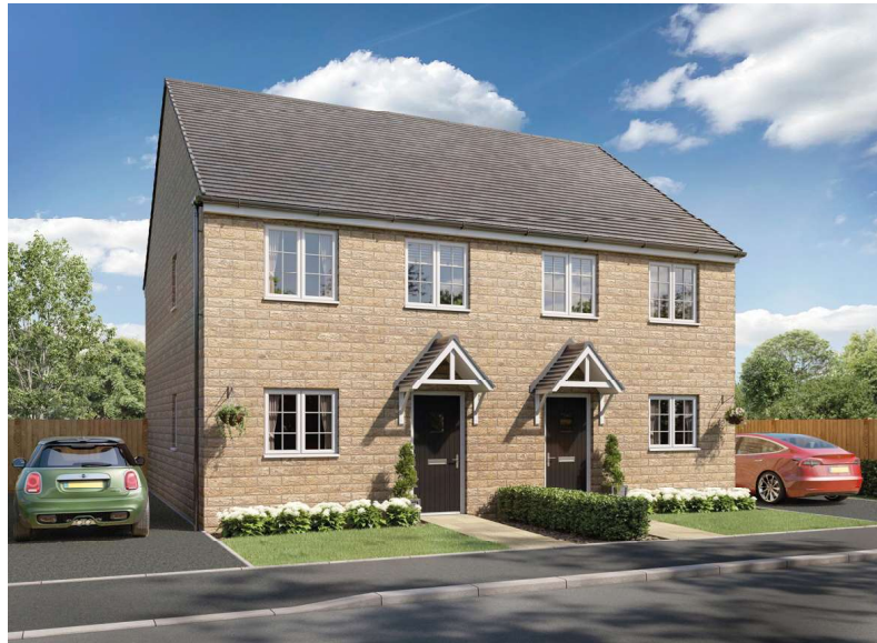
Figure 7 - 3D Visualisation of a typical semi detached house type