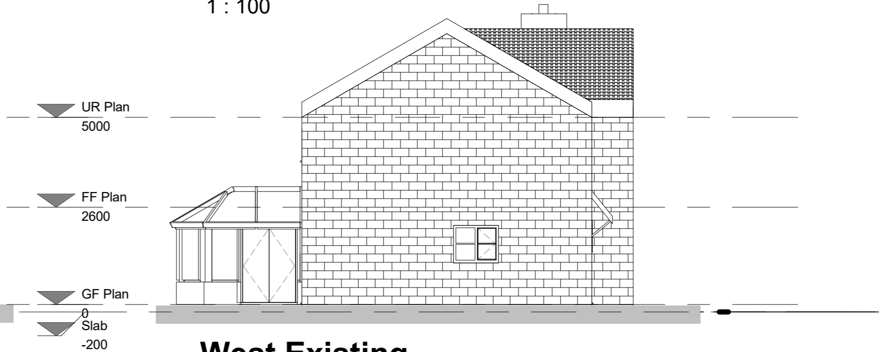
West Existing 1 : 100