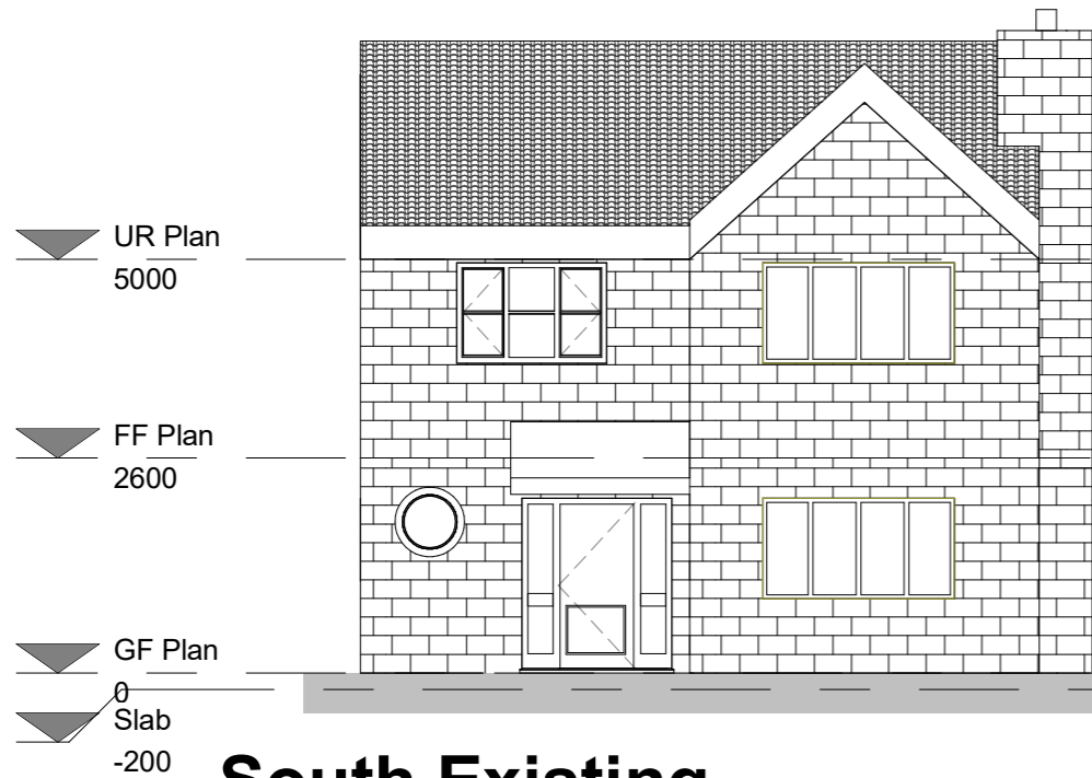
South Existing 1 : 100