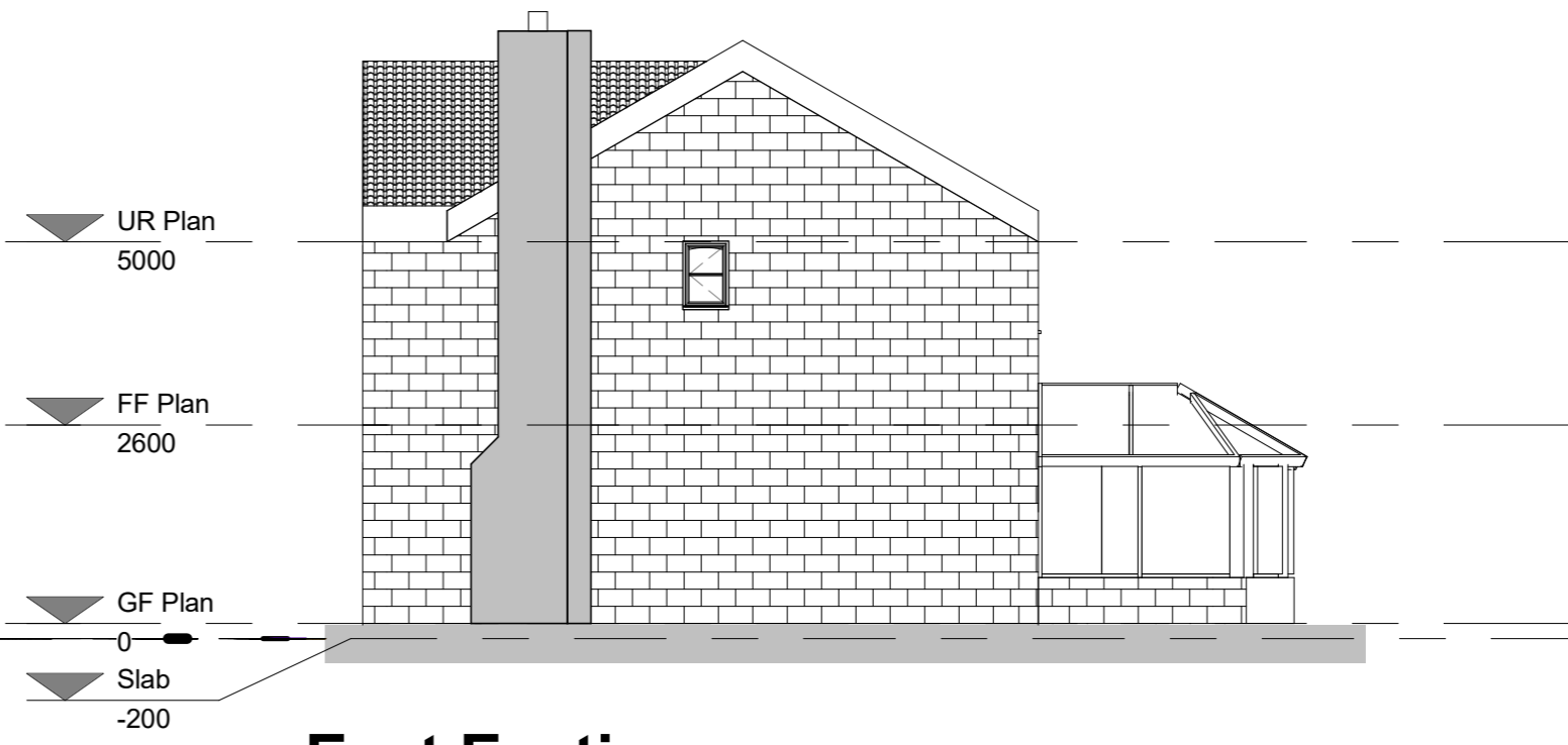
East Existing 1 : 100