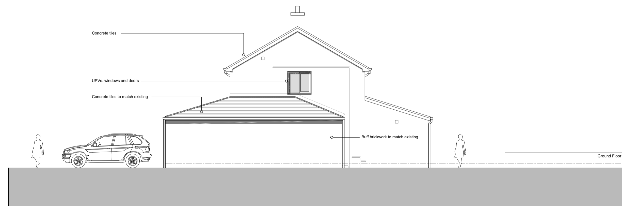
Elevation H [North West]