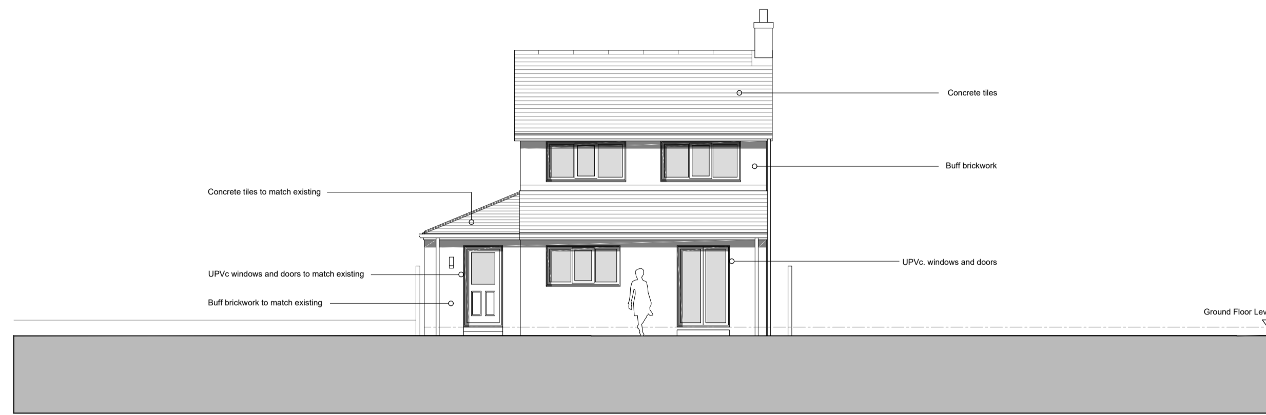
Elevation E [South West]