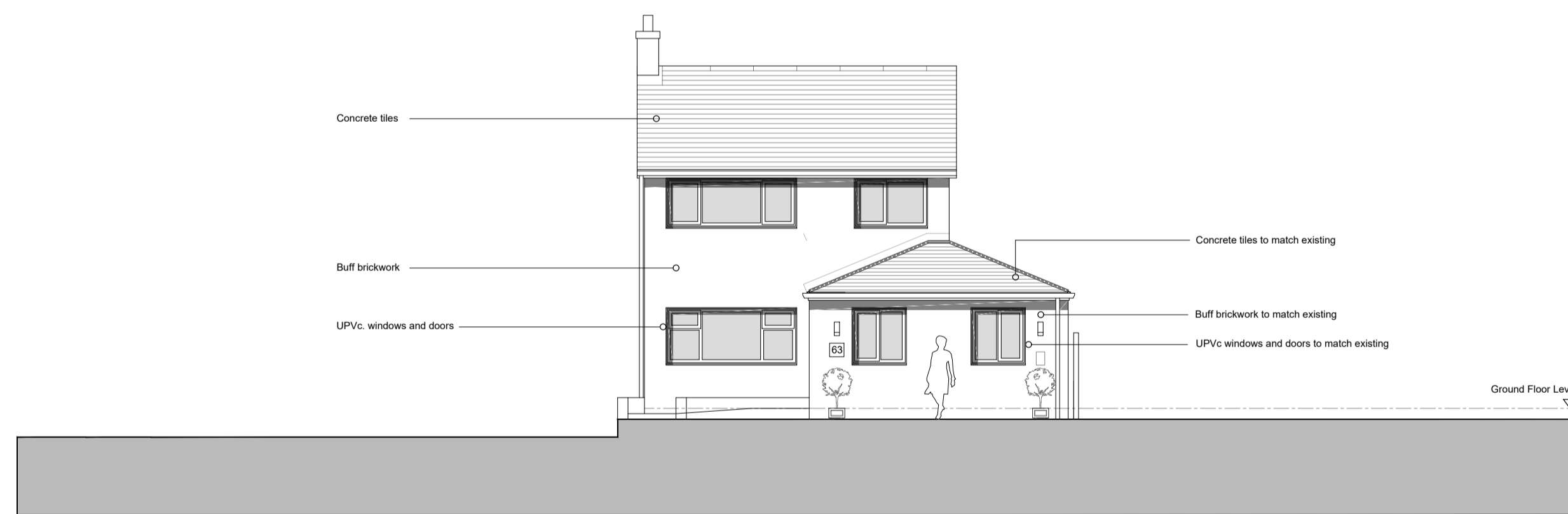
Elevation G [North East]