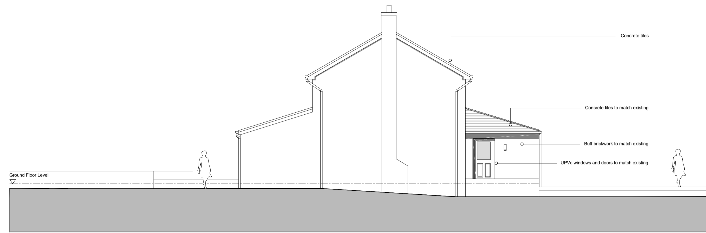
Elevation F [South East]