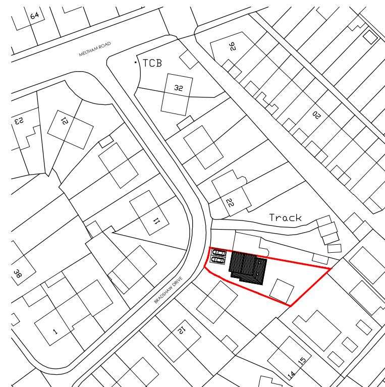
LOCATION PLAN_ AS PROPOSED