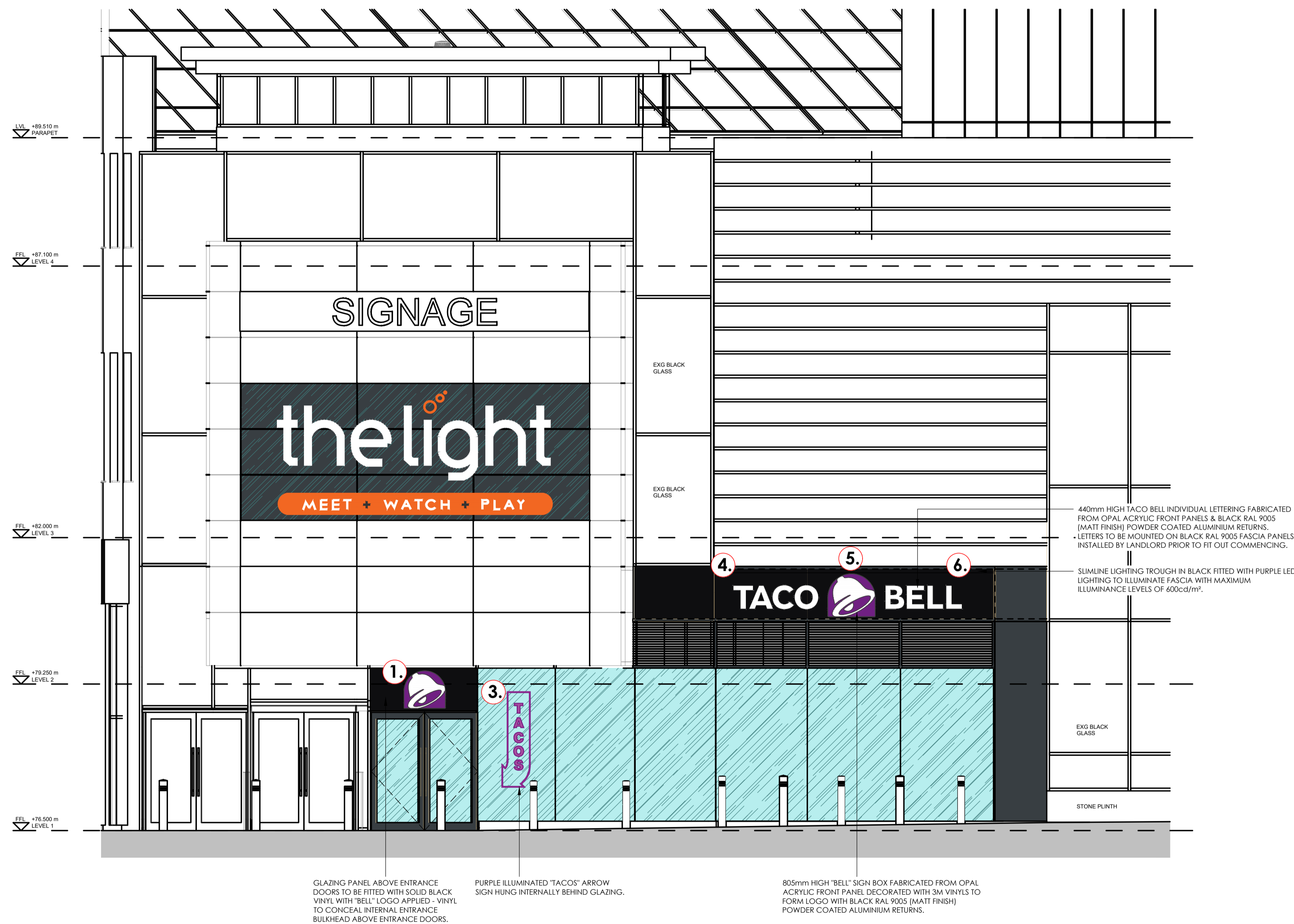
proposed front elevation scale - 1:50 @ A1 / 1:100 @ A3

ALL DIMENSIONS TO BE CHECKED ON SITE. DO NOT SCALE FROM THIS DRAWING EXCEPT FOR THE PURPOSES OF LOCAL AUTHORITY PLANNING