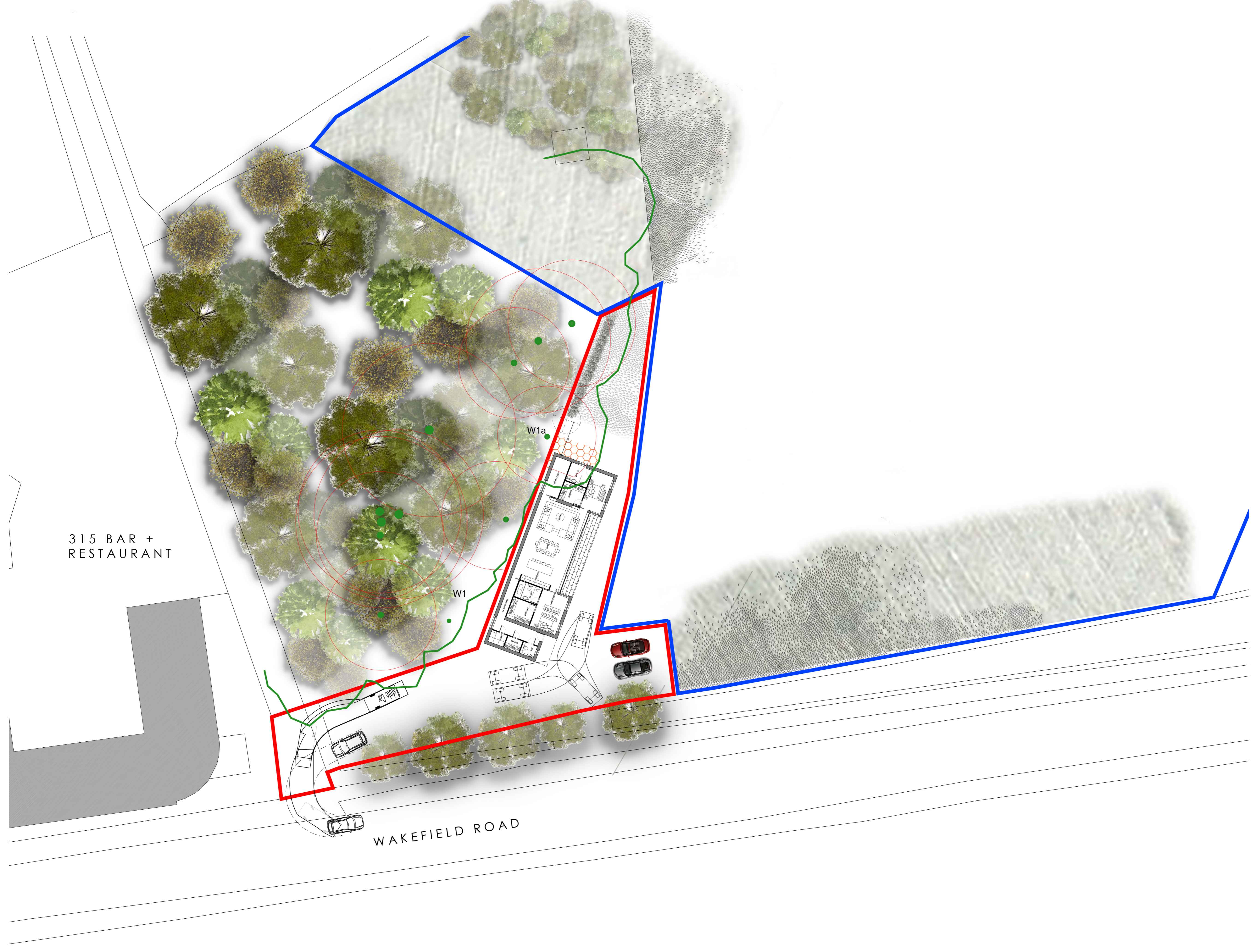
SITE PLAN AS PROPOSED SCALE 1:200