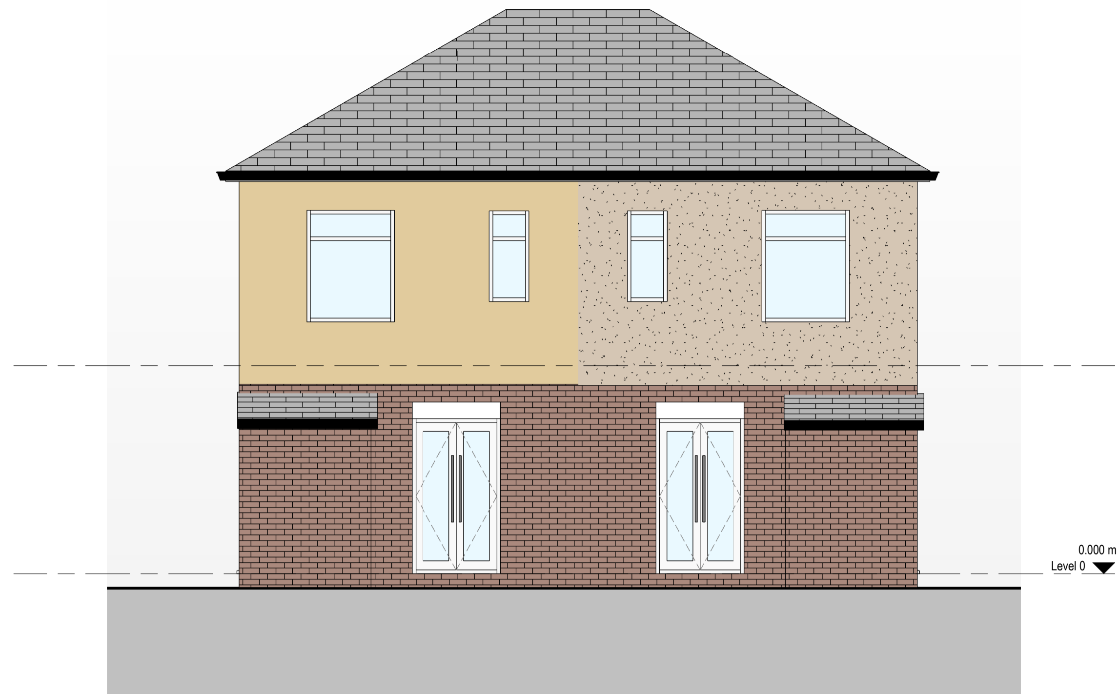
1 Rear Elevation 1 : 50