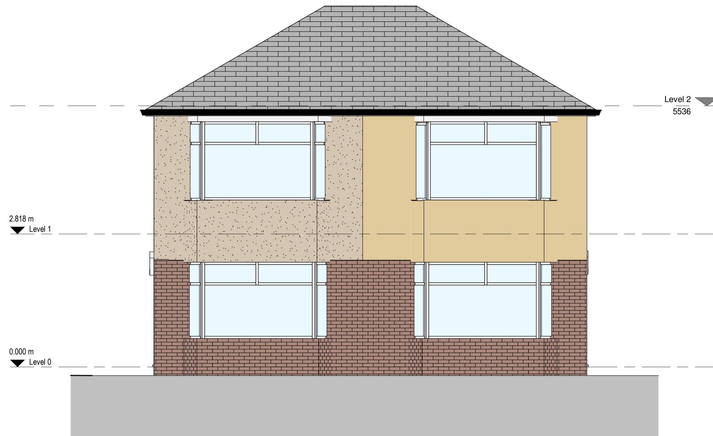
2 Front Elevation 1 : 50