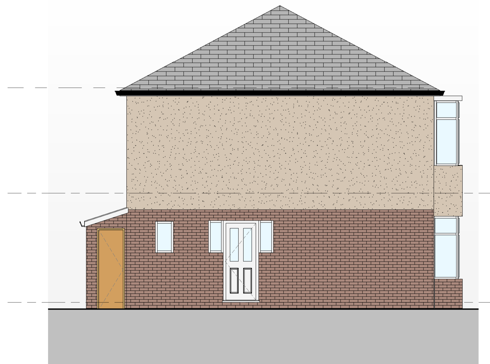
3 Side Elevations 1 : 50