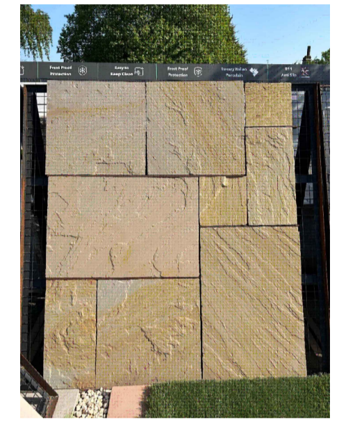
Melton Rippon Buff Premium Indian Sandstone Paving