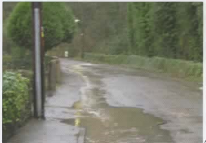
↑ Sewer surcharge, Gynn Lane, 2020

With the new street furniture to the bottom of the lane it has become tighter, with parking on both sides moved further up the lane. Parking at peak school and work times adds further congestion, so 100+ more cars will only add to these issues.