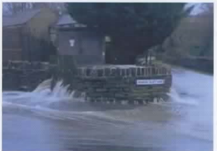
↑ Flooding to Gynn Lane / Marsh Platt Lane, 2025

To view the application, search for number 2025/62/91370/W on the Kirklees planning portal, or scan this QR code with your camera phone.