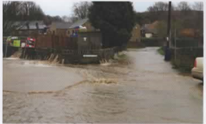
↑ Flooding to Gynn Lane / Marsh Platt Lane, 2019

Historically Gynn Lane has suffered from flooding to the bottom of the lane, with surcharges to drains down Hall Ing and Gynn Lane, and residents experiencing flooded homes – this is before a hardstanding development is built on a site that is currently absorbing rainfall.